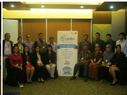
CEIT instructors together with the other delegates in the 4th ASEAN Summit held at Bogor, Indonesia