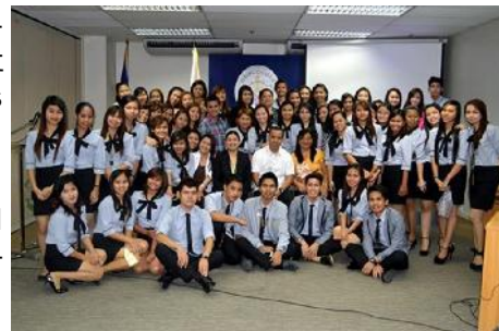
The students of BS Office Administration together with the faculty of Office Administration Unit during their Inspections Trip and Seminar at the Office of Ombudsman .