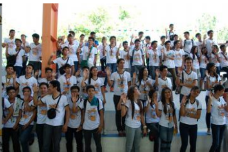
Electrical Engineering students participate in the EELYMPICS on August 16 to 17, 2014 at the CvSU Rosario campus.