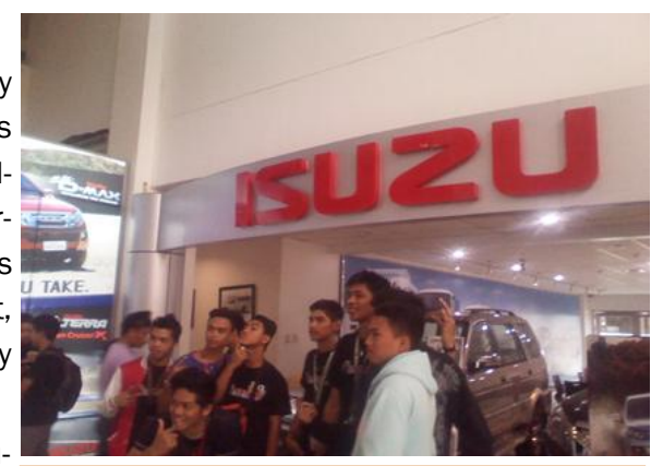
Students visit Isuzu Phils.

This will be of great help for them to fully visualize the actual operations involved within different industrial firms. Exposing them to industrial operations will be an eye opener for them to iden-