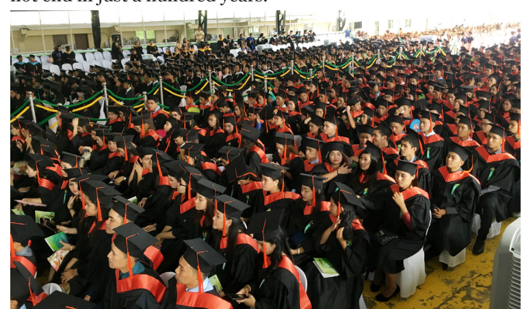
The centennial candidates for graduation waiting to be conferred

This commencement exercises is a proof of the University's continuing dedication towards quality education which does not end in just a hundred years.