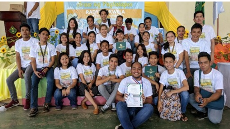
Graduates of School-on-Air: Radyo Eskwela Program pose after the ceremony

2018, reaching over 600 agriculture students of CvSU and swine raisers from the city/municipalities of Cavite province. (APDaria)