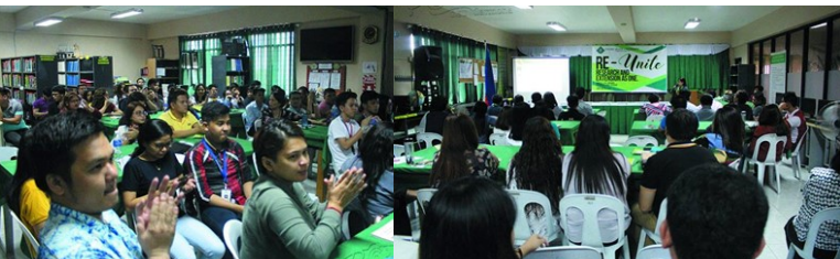
Students and faculty participants during the seminar-workshop

As an outcome, employees of the campus presented their formulated campus research and extension agenda that will be used to ensure a single direction in all outputs of the campus pertaining to Research and Extension activities. (CEBManabo)