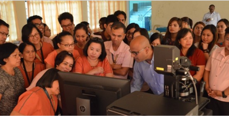
Participants during the seminar-workshop

with the faculty and staff of the department, officers of the Mitochondrion Society and selected BS Biology students.