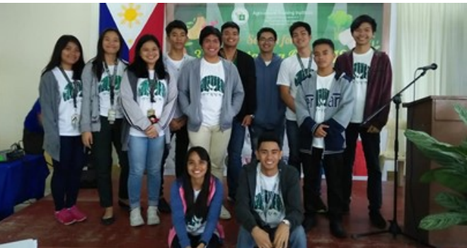
The CvSU students at the 3 rd search for Kabataang OA CALABARZON 2018

The search for Kabataang OA is an annual competition on organic agriculture by the Agricultural Training Institute Region IV-A which is participated by different state universities and colleges from CALABARZON. A total of 78 participants from different SUCs in the region joined the competition this year.