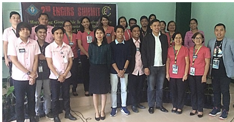
The facilitators, keynote speaker, paper presenters and participants of 2 nd EnGIRS Summit