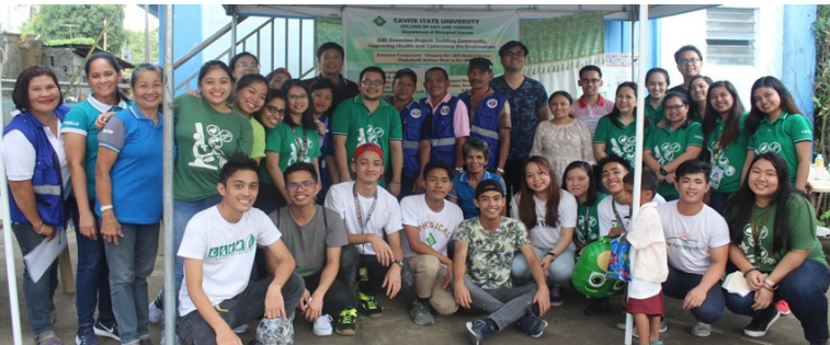
The whole team after the medical service