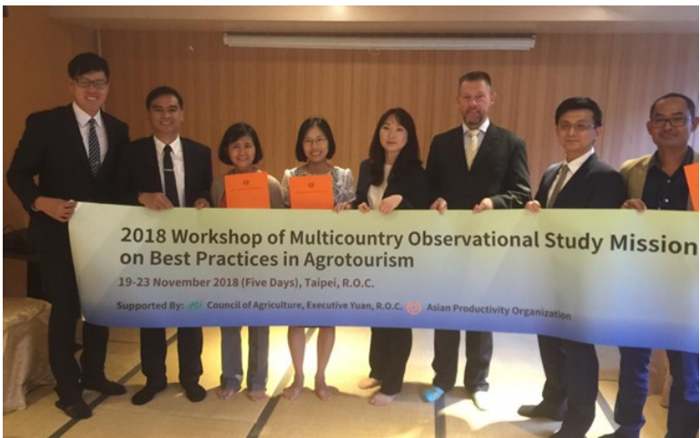
Participants together with APO, Council of Agriculture (COA) and China Productivity Center (CPC) officials during the closing ceremony