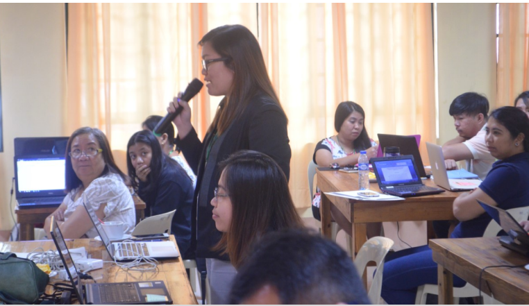
Trainees participated during the training-workshop on translating research results to ISI publishable format

online entitled "Village-Level Production and Value-Adding Technologies for Sugar Palm". Fifteen research papers authored by faculty/researchers published in scientific journals were given incentives amounting to Php 158,500.00 and Php 67,366.30 on publication fees. The PCD also conducted one seminar-workshop which capacitated 16 researchers in translating research results to ISI publishable format.