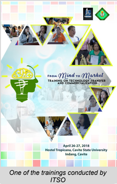
One of the trainings conducted by ITSO