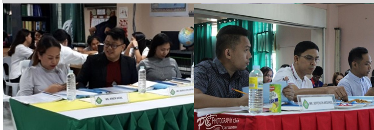
(Left) The external evaluators for the Social Sciences category (right) The external evaluators for the ICT category