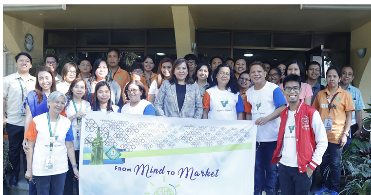
The KMC officers and staff with the speaker and participants of “From Mind to Market” training on technology transfer and commercialization