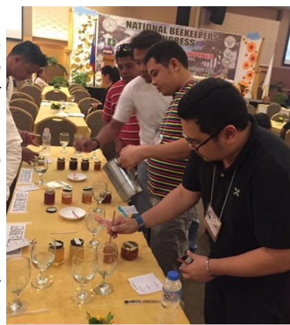
pports mental social social honey contest (A. mellifera, native honeybees and stingless bees categories)

Being one of the few SUCs in the country with a program that supports beekeeping, environmental concern, and social responsibility, Cavite State