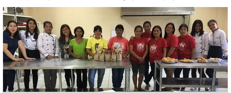
The participants of the training on homemade doughnut making together with the HRM faculty and students

A total of 33 residents were trained on the said activities. Trainees of computer related skills were given a certificate of completion that can be used for job application. Nine (9) female participants who are members of Samahan ng Nagkakaisang Kababaihan of Carmona, Inc. (SNKCI) were trained on homemade doughnut making and its marketing strategies. Starter kits and initial capital were also distributed to the participants after the training. ( JVOcampo )