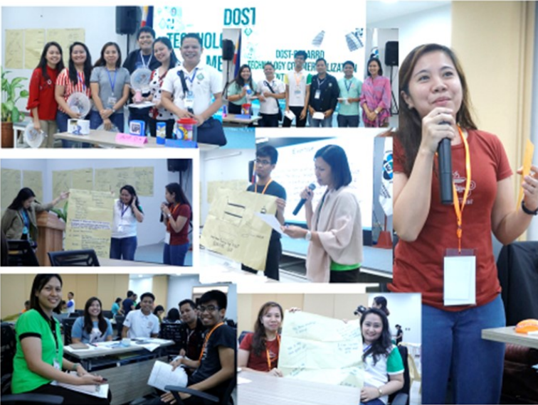
The CvSU delegates actively participate during the TechCom training