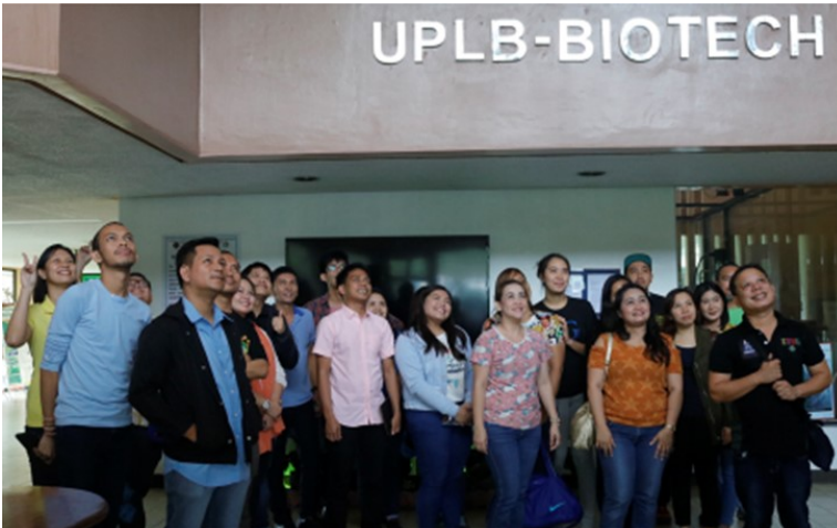
Participants during their field visit at UPLB-BIOTECH.