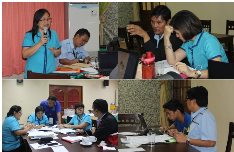
Participants during the planning-workshop

The said workshop was attended by 26 participants who are staff and representatives from Extension Services Center, College of Agriculture, Food, Environment, and Natural Resources (CAFENR), Sugar Palm Research, Information, and Trade (SPRINT) Center, Research Center, and National Coffee Research, Development and Extension Center (NCRDEC).