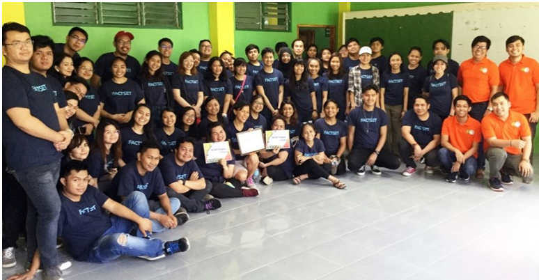
Volunteers from Factset Philippines (wearing blue) together with SPRINT staff (wearing orange) pose after the completion of the activity