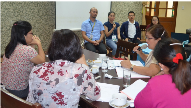
The project proponents responding to the queries of the evaluators

After the defense, proponents are expected to do the