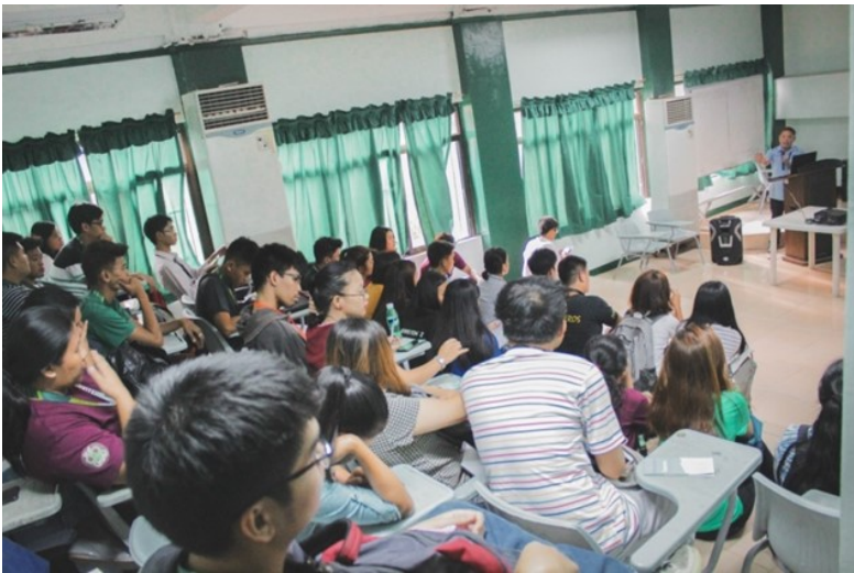
Participants listen attentively to the resource speaker