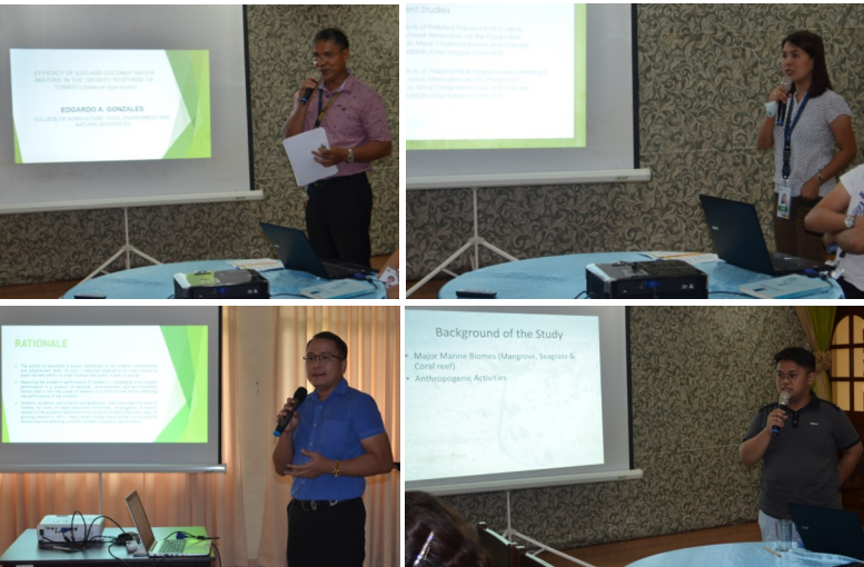
Faculty members presenting their proposals during the event