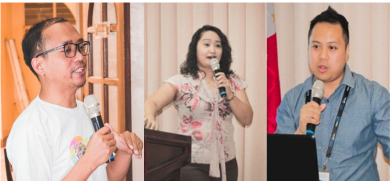
The resource speakers during the lecture-workshop