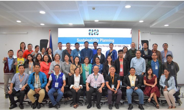
Participants of the sustainability planning-workshop