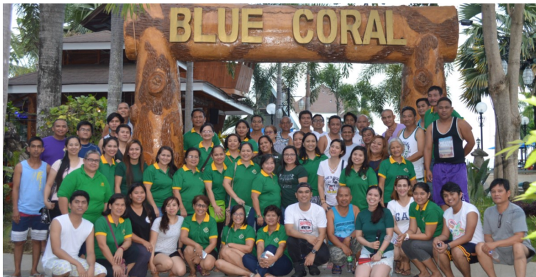
R & E officers and staff during the Lakbay-Aral 2019 in Batangas

CvSU's visit to DLSL is part of OVPRE's two-day Lakbay-Aral 2019 in Batangas which was followed by a general assembly and teambuilding at Blue Coral Beach Resort, San Juan. (LAAOrsal)