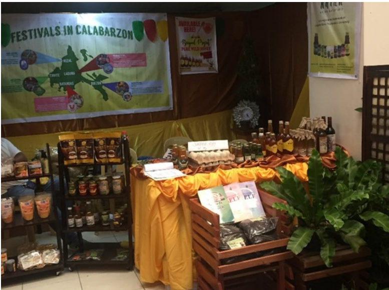
Exhibit booth of Region IV-A during the CHED Silver Anniversary Trade Fair

Since 2016, the Cluster has been offering the prominent Aguinaldo Blend in packed form and brewed beverage in this annual trade fair at reasonable price to CHED employees, guests, and invited visitors. (AJLMagcamit)