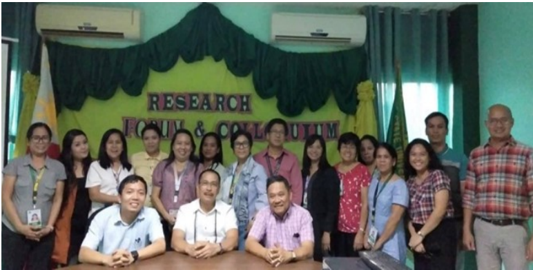
Faculty members of Imus campus together with the evaluators