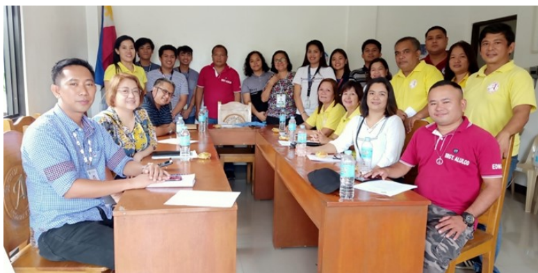
CEIT extension team with barangay officials of Alulod, Indang, Cavite