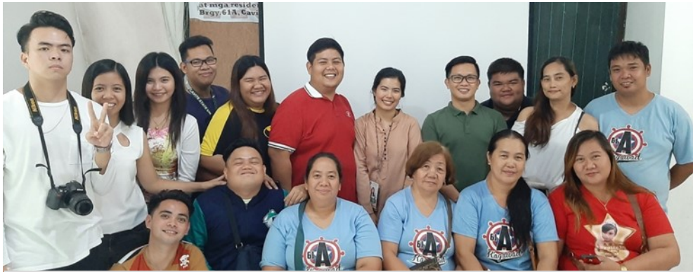
CvSU Cavite City faculty members, students and alumni together with Barangay 61-A Talong officials