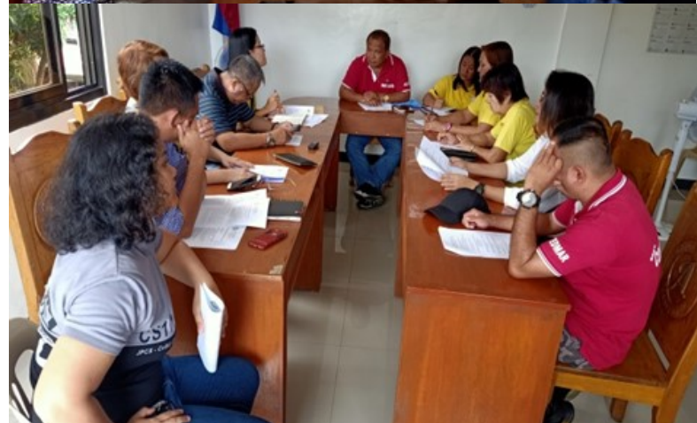
CEIT extension program consultative meetings with barangay officials of Alulod, Indang, Cavite