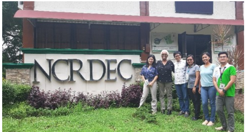
NCRDEC staff together with the PhilCAFE project representatives