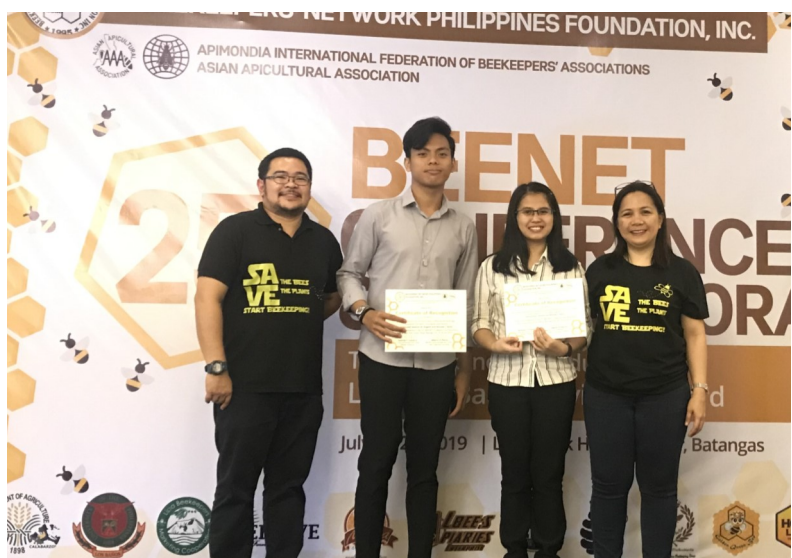
The participants from CvSU during the 25 th BEENET Conference and Tecno-fora