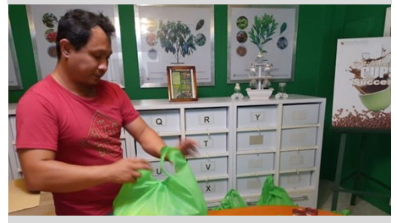
Repacking of relief goods