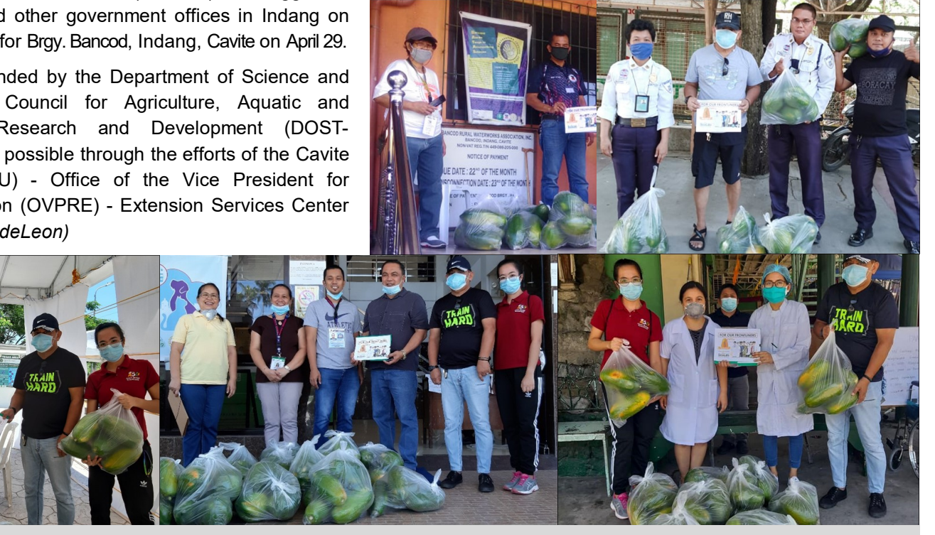
SciCAT project staff and ESC employees during the distribution of papaya to frontliners