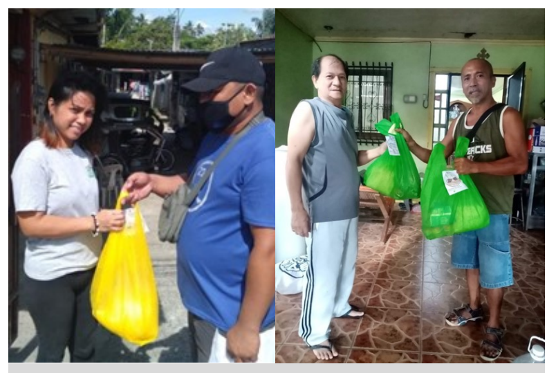
NCRDEC staff distributing relief packs

This effort was organized since some workers were affected by the no work, no pay arrangement when the enhanced community guarantine (ECQ) was implemented.