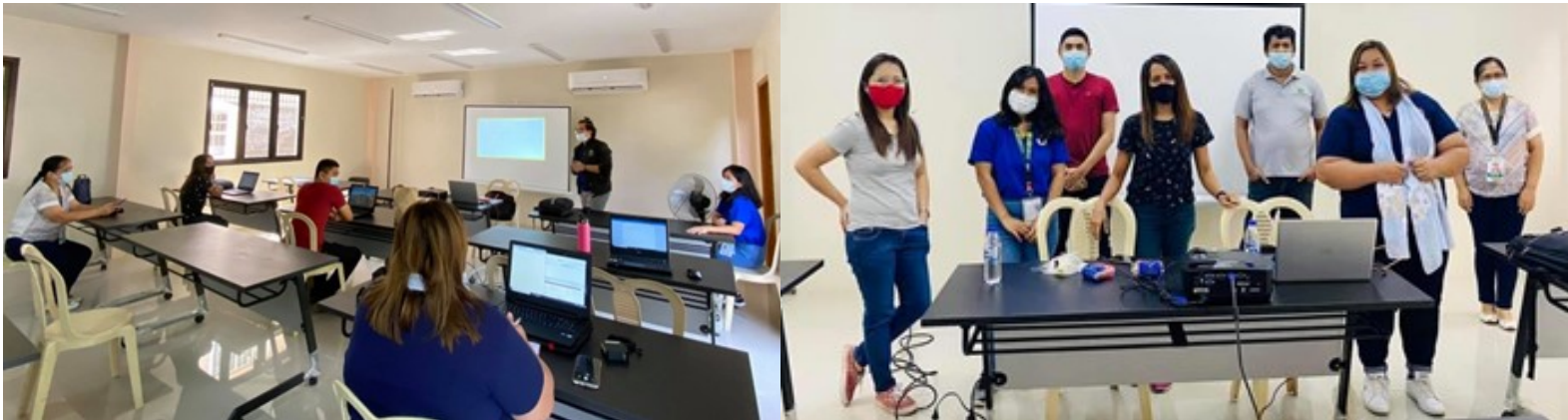
ES Webinar Management Team during the group learning session with trainers from DA-ATI IV-A

After the group learning session with DA-ATI IV-A, the ES webinar management team conducted the pre-broadcast activities for the first webinar series titled "BEEyond the HIVE: Introduction to Beekeeping" with six episodes. Pre-broadcast activities include webinar management team meetings, preparation of google forms, promotion of activity by uploading teaser videos and posters, video shooting and recording for the actual webinar, and video editing as well as (continue on page 4