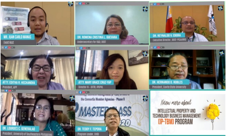
Launching of the 3 rd DOST-PCAARRD Intellectual Property Master Class