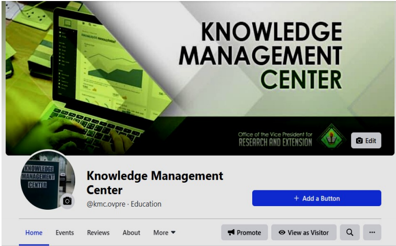
The Knowledge Management Center Facebook page