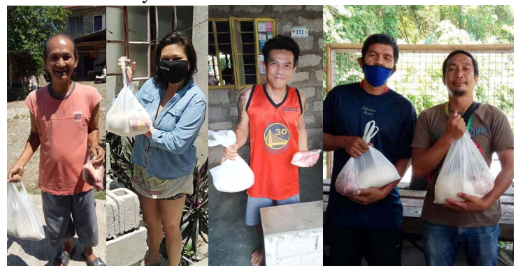
CvSU delivers food packs to administrative aides