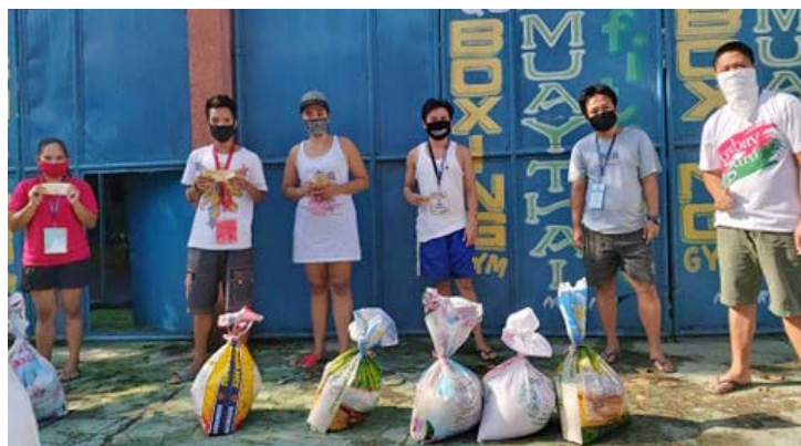
Recipients of donations from CvSU-Bacoor

Grocery packages and additional face masks to families in Brgy. Lucuhin, Alfonso, Cavite and to frontliners of Baragay Limbon, Indang, Cavite in collaboration with CvSUMPC- Community Development Committee.