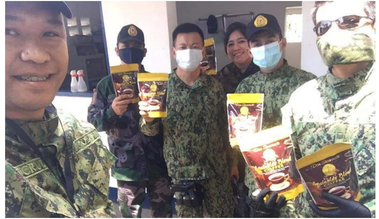
Security frontliners pose with the coffee packs they received