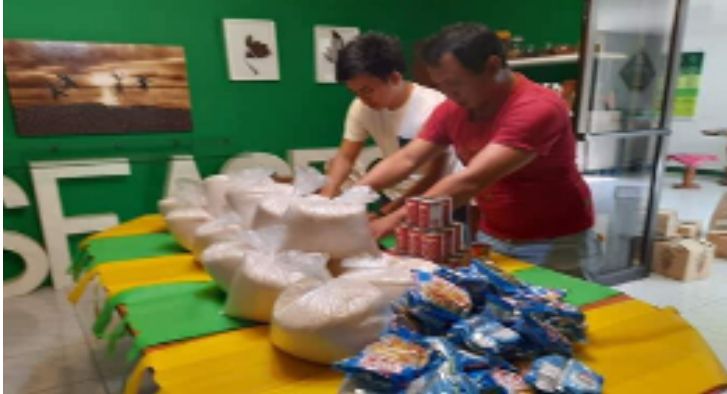
NCRDEC staff prepare food packs

Total collection from sponsors amounting to PhP 40,892.00 were used to buy grocery items that include rice, canned goods and noodles. Meanwhile, those living outside Indang were sent cash assistance considering that they are on a “no work, no pay” basis since the start of the community quarantine. Also included in the beneficiaries are farm workers serving in the University.