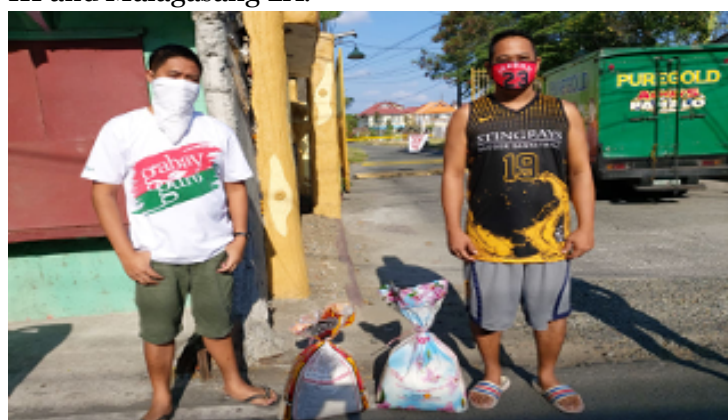
Relief packs received from sponsors

Massive information dissemination campaign was also launched as 2000 copies of the Clean and Disinfect flyers were distributed to the residents of Brgy. Molino 1, 2 and 6 and to the establishments in Mambog IV, Bayanan-Mambog boundary, Wood Estate Subd. Molino III and Malagasang 2A.