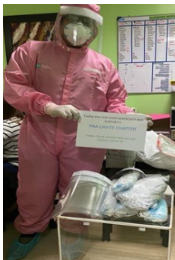
A frontliner receiving donation

College of Nursing (CoN) is not only a home to a number of frontliners working as healthcare providers against COVID-19. The said college, through the efforts and donations of its faculty and staff, in collaboration with alumni and the Philippine Nurses Association-Cavite Chapter, has never stopped extending assistance in various forms to a lot of beneficiaries: