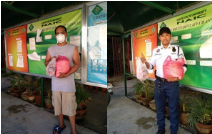
Recipient of food packs distributed by Naic

They also delivered food packs security guards and utility workers reporting in campus and to frontliners who are reserved armies from Labac, Mabulo, Bancaan, Sapa, Bagong Kalsada, Bucana Malaki, Kanluran, Balsahan and Ibayo Estacion. Donations from faculty and staff of CvSU Naic Campus were utilized to fund such project.