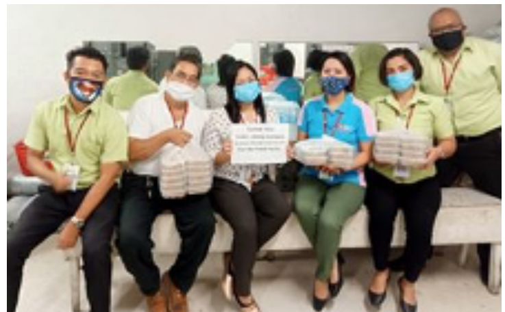
Frontliners receiving food packs from CvSU Silang

Entitled "Tulong Pantawid sa Panahon ng COVID", this first project delivered food packs and sanitation kits to utility workers who are serving even amidst the implementation of community quarantine.