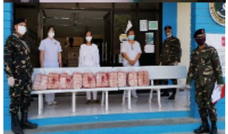
Partners and alumni send packs to medical frontliners

Major funds came from private individuals of IHMC Batch 1978 and some additional donation from faculty and staff of CCJ. This was made possible in collaboration with Philippine Nurses Association-Cavite, CCJ alumni as frontliners in the Philippine National Police and Armed Forces of the Philippines and alumni from the College of Nursing working in hospitals.