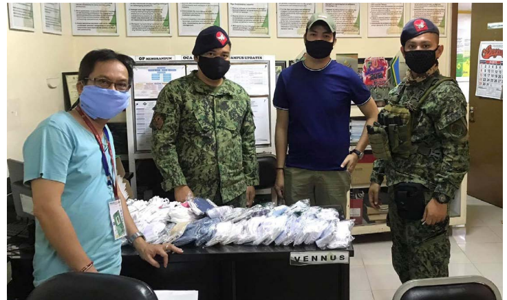
Beneficiaries receive donation from CCAT

All of these were made possible through the spirit of cooperation and generosity – the Bayanihan in CvSU-CCAT.