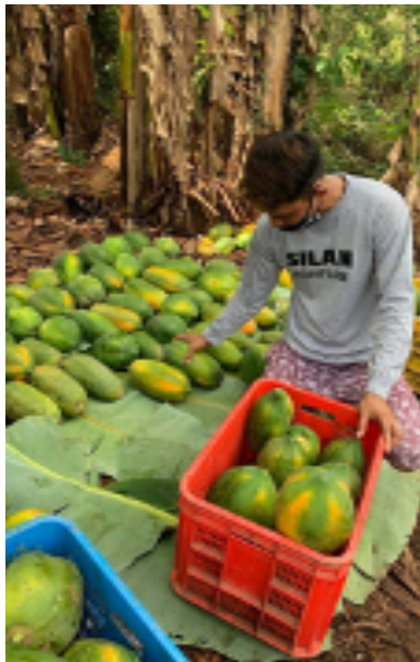
Freshly harvested papaya from Silan Agri Farm

The second wave has distributed 101 fresh papaya to the frontliners in General Emilio Aguinaldo Memorial (GEAM) Hospital in Trece Martires City, Cavite while the third wave benefitted 185 frontliners in the Public Market, Bureau of Fire Protection and Municipal Disaster Risk Reduction and Management Office in Indang, MV Santiago Medical Center in Trece Martires City, and City of General Trias Doctors Medical Center in the City of General Trias.