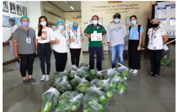
Frontliners receive papaya from Project SciCAT

Project SciCAT is funded by the Department of Science and Technology- Philippine Council for Agriculture, Aquatic and Natural Resources Research and Development implemented by CvSU in partnership with Agri Silan Farm in Indang.