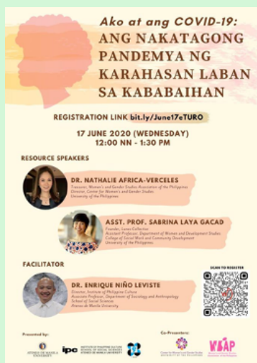
IPC WE Can Seminar Promotional poster

The activity was jointly participated by 304 different GAD advocates and experts from various units of academic institutions, private sectors, and local government units. In addition, the webinar gave inputs about the launched campaign