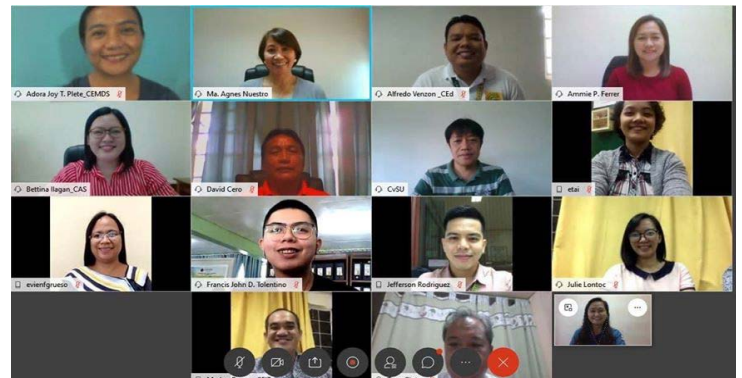
Webinar team conducts regular meeting