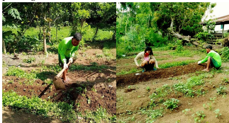
Residents prepare their backyard gardens

The project initially started with giving assistance to eight heads of families in the area who planted squash, okra, string beans, sponge gourd, eggplant, tomatoes, pepper, papaya, mustard, and radish. Aside from giving the seeds used, they were guided in layouting their backyard and in preparing their growing beds and planting holes.