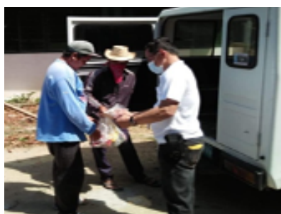
Stranded construction workers receive assistance

Since the pandemic started, continuous inspection and disinfection of vehicles entering the University premises was being done. Thermal scanning was also included in the protocol for all personnel reporting in the campus. In support to the programs of the Office of the Vice President