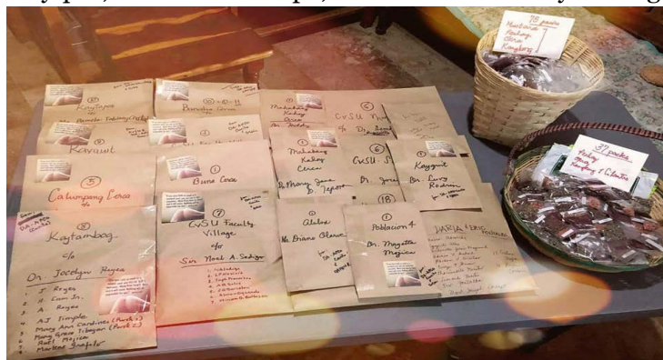
Seeds repacked for distribution

To assist residents in their home gardens, more than 155 beneficiaries received vegetable seeds (pechay, mustard, okra and kangkong) requested from the Department of Agriculture- Office of the Agriculture Provincial Coordinating Office. Recipients include CvSU employees and residents of the Bancod, Mahabang Kahoy, Buna Cerca, Calumpang Cerca, Poblacion, Kayquit, Mataas na Lupa, Carasuchi and Kaytambog.