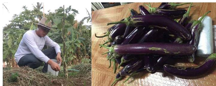
Eggplants harvested from the backyard garden

Farm inputs and technical assistance was given by ES improving the quality of harvest particularly of eggplants.