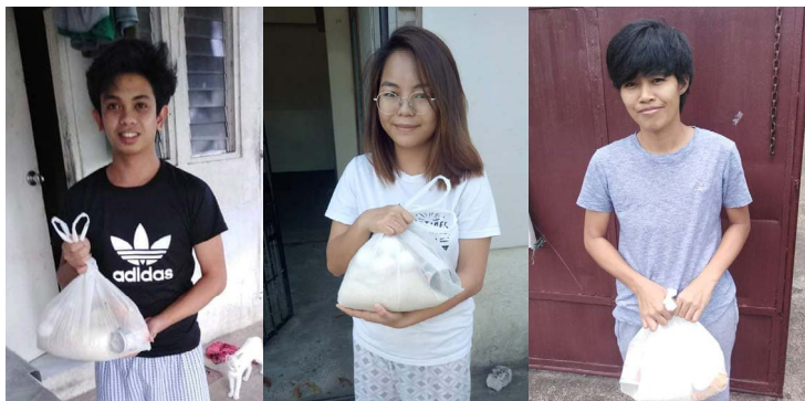
Stranded students receive food packs

The last wave of 184 food packs for stranded students were distributed as the semester closes.