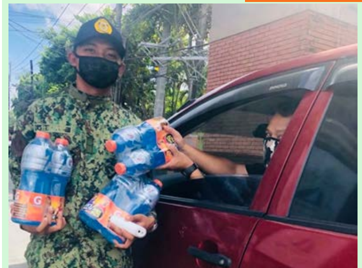
Cavite State University-Cavite City campus continues to assist frontliners in nearby communities as they serve amidst the pandemic.