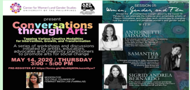
Conversations through Art: Women, Gender, and Film Promotional poster