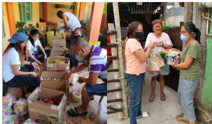
Bayanihan sa MKC members repacking and distributing relief to the residents