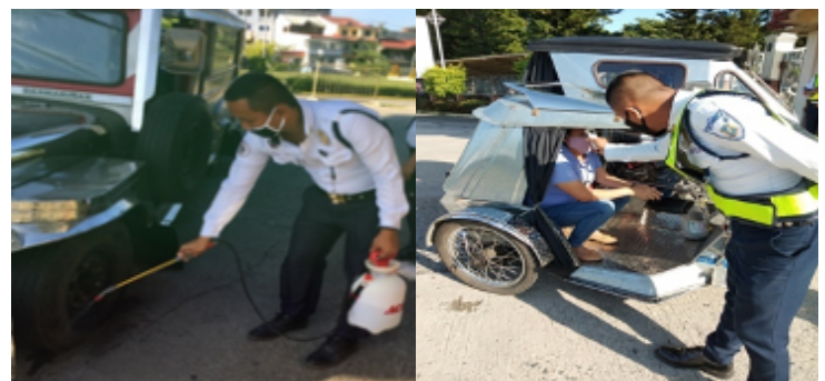
Security guards conduct disinfection and thermal scanning

UCC regularly coordinates with the nearest barangays for the proper implementation of guidelines relevant to controlling COVID-19.