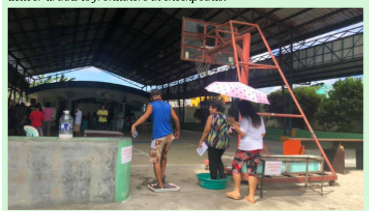
Campus court was used as a venue in distributing financial aid to Brgy. 8 residents.