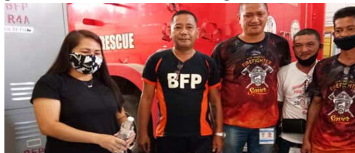
Ms. Grafilo of RC delivers alcohol to frontliners

For their second wave of distribution, they gave more bottles to frontliners stationed in checkpoints, gas stations and stores in Indang.