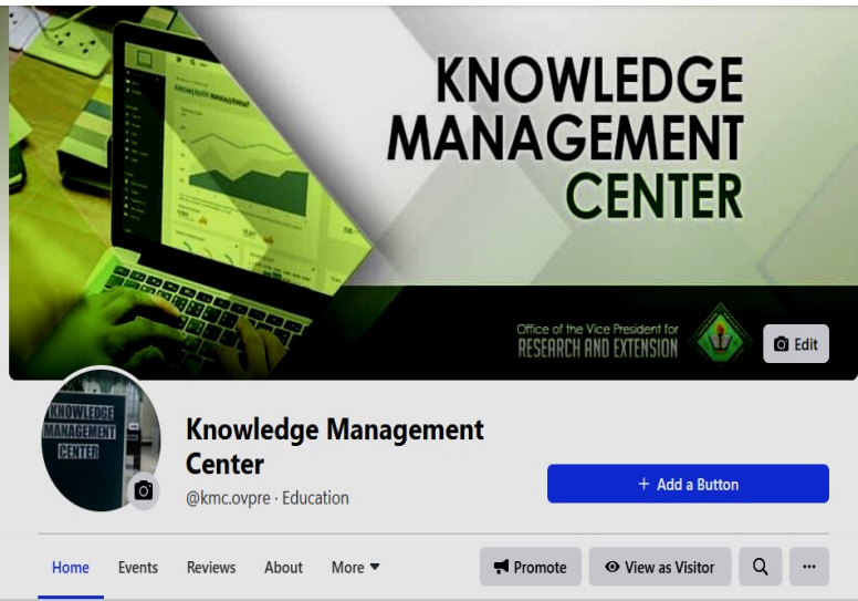
The Knowledge Management Center Facebook page

Tel. No. (046) 415-0212 E-mail: renewslatter@cvsu.edu.ph