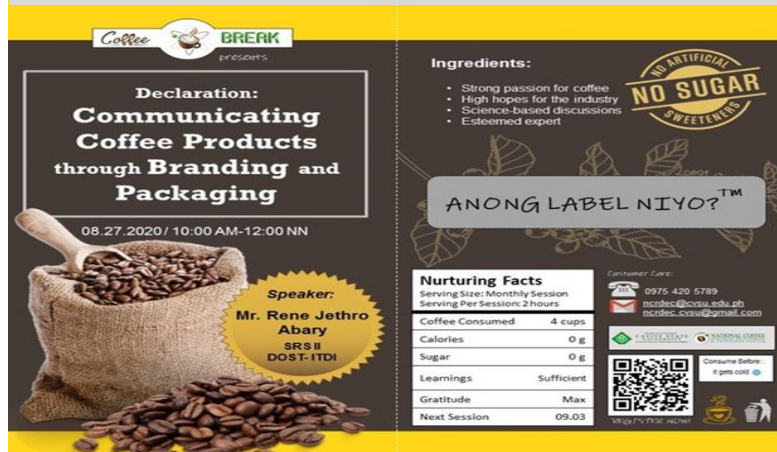
A screenshot of the 3 rd session of the Coffee B.R.E.A.K. webinar series held last August 27 via Cisco Webex

The sessions were attended by a total of 165 participants from various academic institutions, government agencies and local government units, members of people's organizations and non-government organizations, owners and personnel of private enterprises, and coffee enthusiasts.