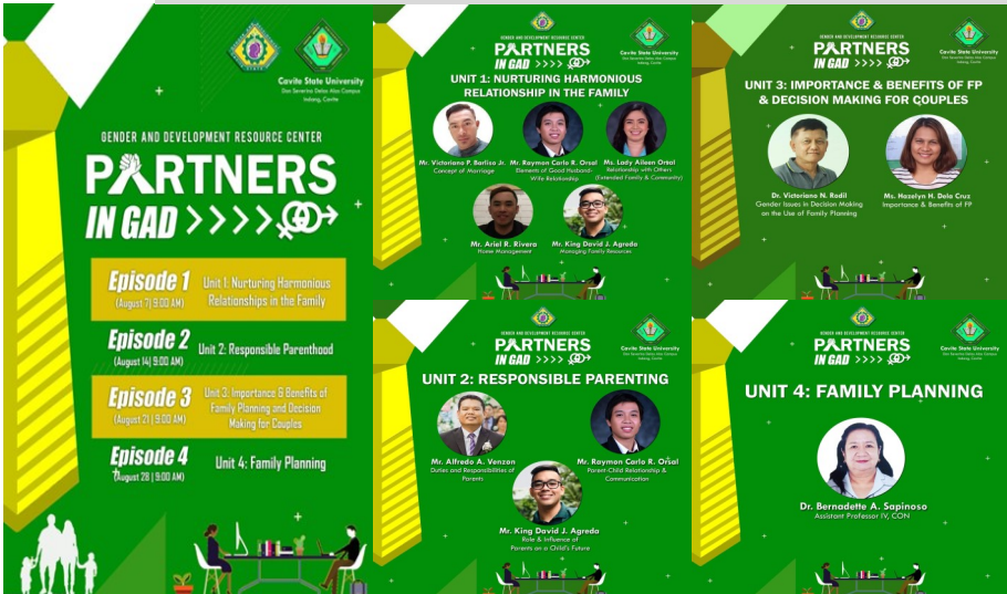
GAD webinar poster with the resource speakers