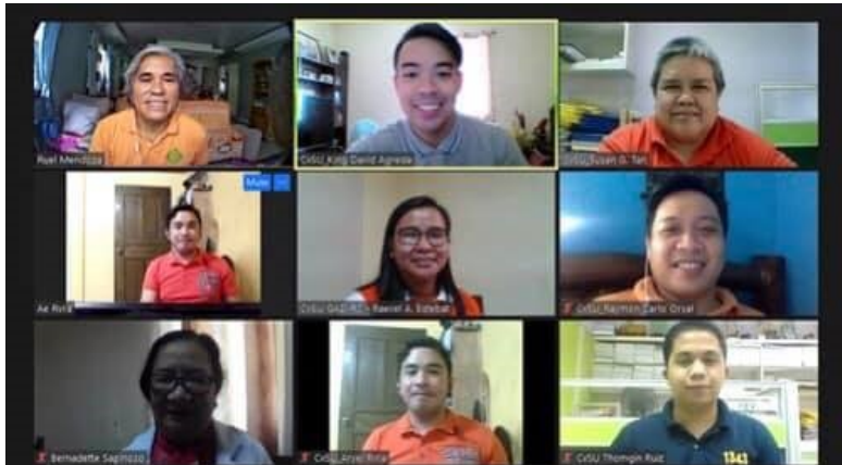
Organizers of the GAD webinar during their meeting

program to mainstream various gender issues, men's and women's involvement in equal roles, needs, opportunities, interests, and responsibilities in the changing world.