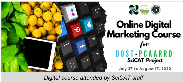
Digital course attended by SciCAT staff

The course was conducted from July 27 to August 17, 2020 through an online platform. The main objective of the course was to help the farm tourism sites developed under the SciCAT project to compete and grow online using different digital marketing tools and strategies. Specifically, at the end of the course, the participants were expected to have a broader understanding of the importance of digital marketing; identify customer segments including their needs and wants through Market Research; learn the fundamentals in writing and designing content and online posts; learn how to set-up a website; identify and apply the different digital marketing tools to drive online traffic; measure and improve digital marketing strategies; and learn techniques and ways to maximize Facebook, Instagram, and Email in generating leads and promoting products and services.