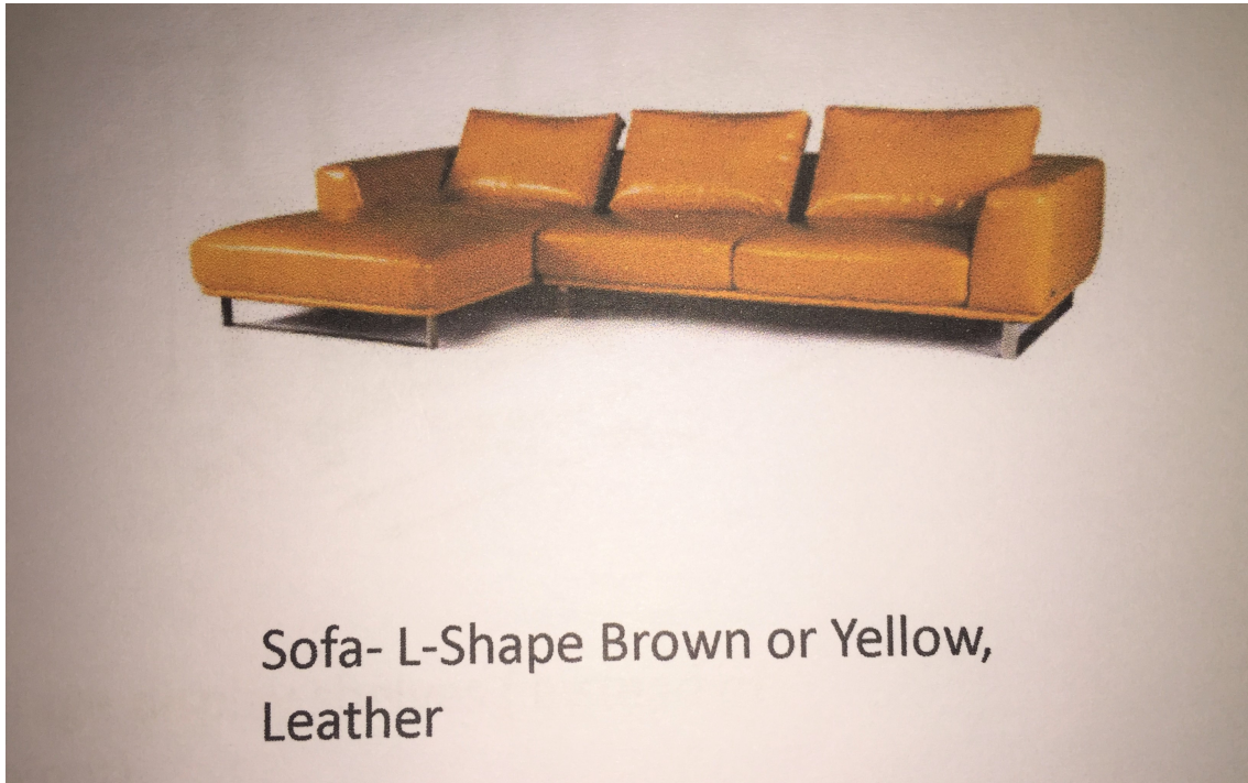
Sofa- L-Shape Brown or Yellow, Leather