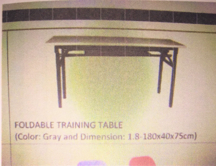
FOLDABLE TRAINING TABLE (Color: Gray and Dimension: 1.8-180x40x75cm)