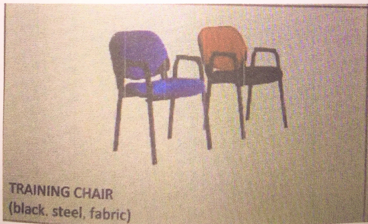
TRAINING CHAIR (black, steel, fabric)