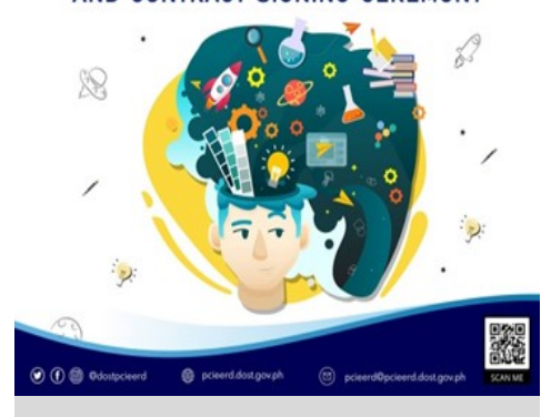
Poster of the YIP announcement

YOUNG INNOVATORS PROGRAM (YIP) ANNOUNCEMENT OF 2020 YIP GRANTEES AND CONTRACT SIGNING CEREMONY