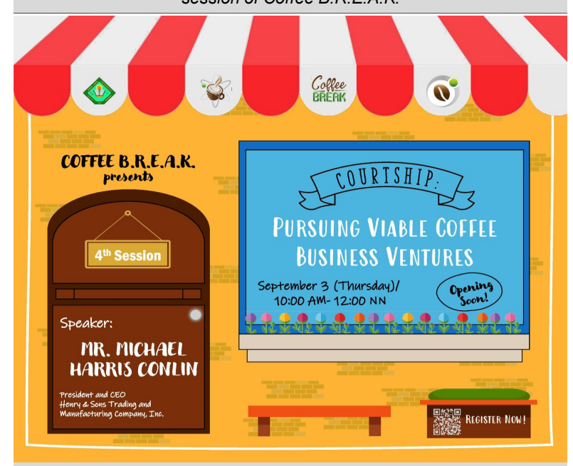
Poster of the 4th Coffee B.R.E.A.K. webinar series