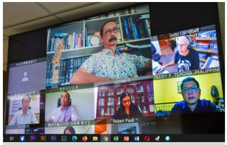
Screenshot of the meeting of the steering committee

DFNet experts from the Asia-Pacific region were invited to discuss on the following areas: dragon fruit imports and exports: practices, challenges and country experiences; Good Agricultural Practices (GAPs), quality standards and quarantine requirements for international markets; nutritional and functional traits, value addition, processing properties, and consumer preferences; and successful stories, and public and private partnerships.