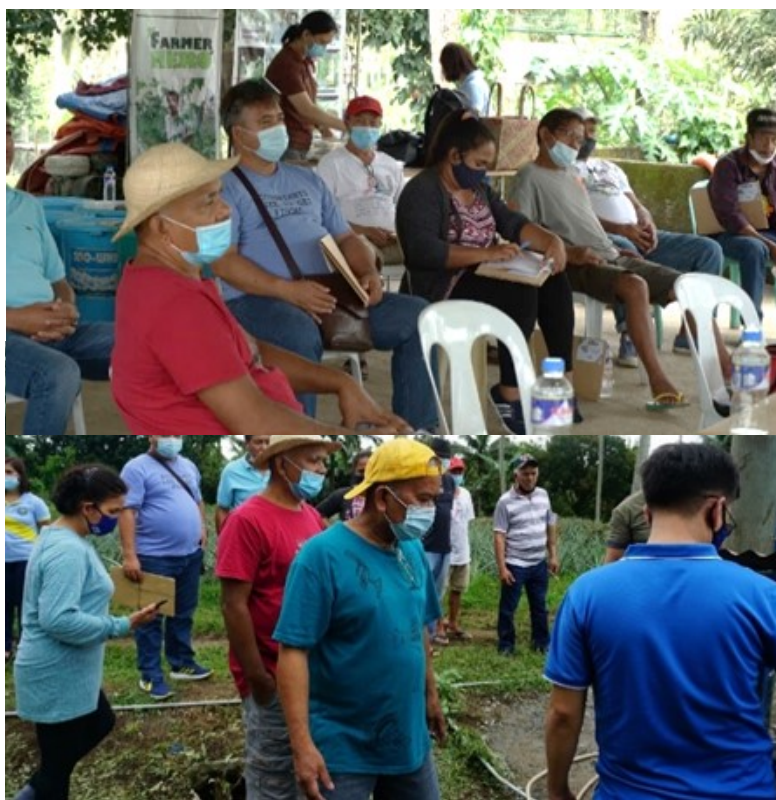
Participants of the Drip Irrigation seminar and demonstration

The capability enhancement and skills training of the SciCAT Project aims to capacitate farmers and farming enthusiasts on recent agricultural technologies generated by Cavite State University and other research institutions in the country. The activity also serves as a medium to cultivate a technology-driven mindset in the community to address the present challenges of agriculture in the country. Through the University's continuous partnership with Silan AgriFarm, the SciCAT Project promotes an agritourism model that features the