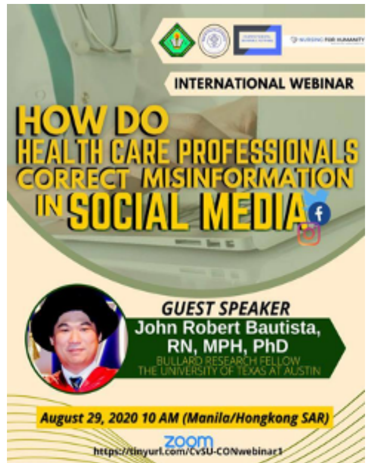
Poster for the activity

“The practical tips can be short term or long term. Short term is that, as we social media users and as health care professionals, we can actually start with our community in terms of our relative- the use of group chat that sometimes tend to post health misinformation. We may want to deal with them first before we can go public, to share more correct information so that instead of false information, the corrected ones will be seen by many. But