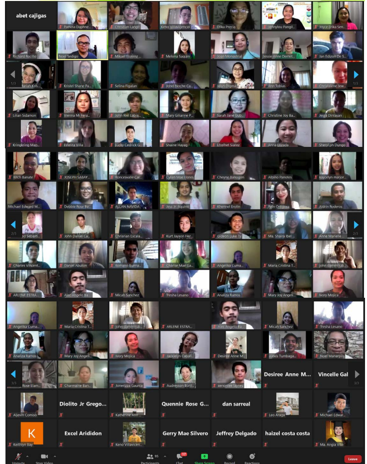
Attendees of the CvSU E-learning training