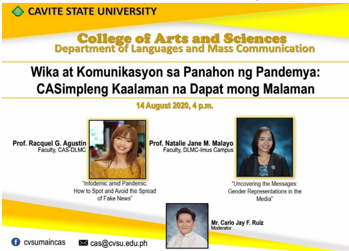
Poster for the webinar