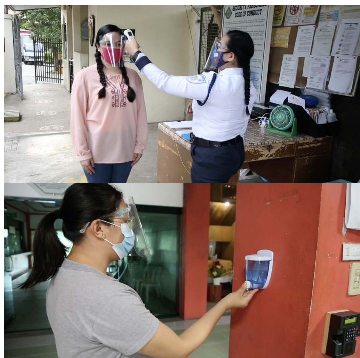
Health protocol being implemented in the campus

To protect the wellness of the academic community, all University personnel were also advised to honestly declare their respective health status upon entering the university premises on a