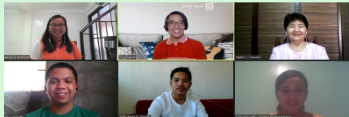
Team who facilitated the activity