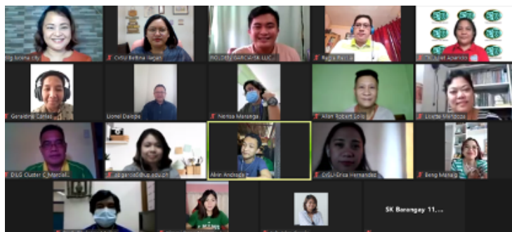
Project team with DILG, CAS and other community members

Entitled “Co-creating Disaster Preparedness Communication as an Approach to Enhancing Community Resiliency”, the project aims to develop a participatory process of creating disaster preparedness communication materials and to enhance the capability