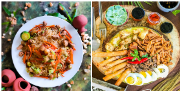
Rocela’s Classic Filipino Stir-fried Adobo Pancit Bihon

A total of 22 entries competed for five awards from the organizers.