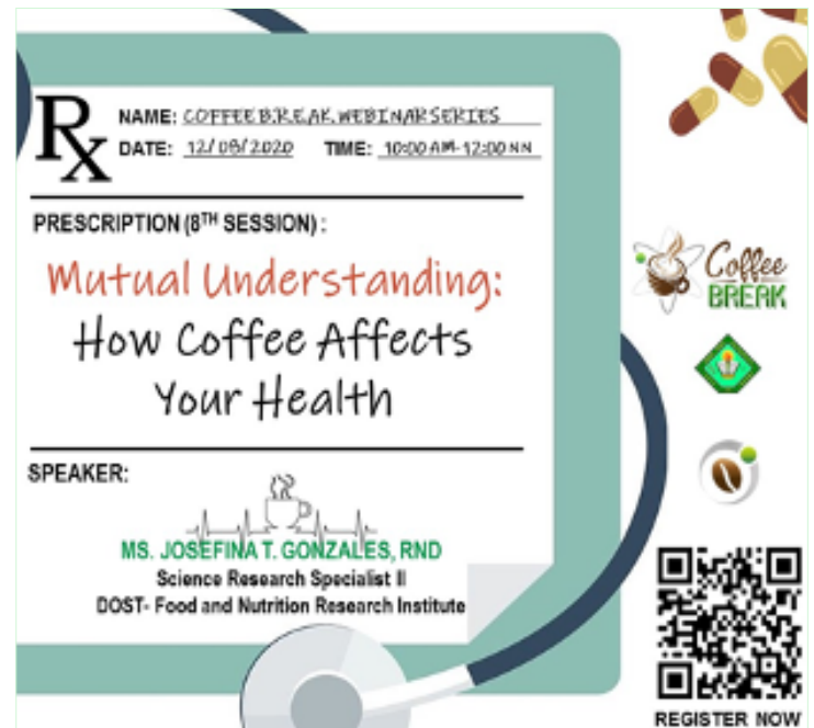
Poster for the activity