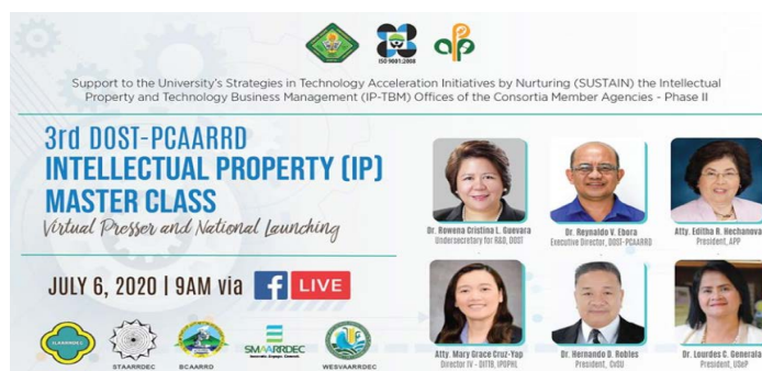
Poster for the launching of the IP Master Class