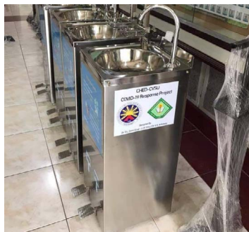
A closer look at the prototypes

Both innovations use foot pedals to ensure minimizing contact compared with other models that require the use of hands and may prevent the further spread of COVID-19. The alcohol dispenser uses the foot pedal to control the lever which squeezes the nozzle of commercially available alcohol dispenser. This low-cost model is comparable to existing commercial models but with an advantage on durability and robustness because of the materials used. Meanwhile, the second model also needs plumbing installation for source of water and