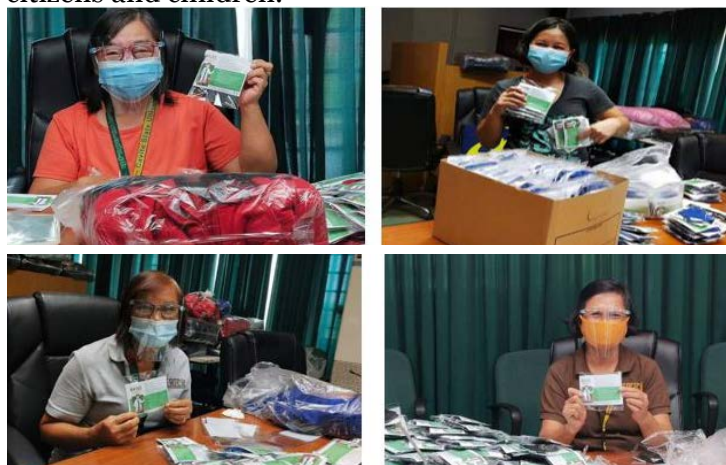
Employees serving as volunteers in the project

This three-month CHED-funded project provided additional support to the existing efforts of national and local agencies in its fight against COVID-19. With CvSU as the implementing agency, it contributed in increasing the capacity to prevent further spread of the virus through the use of facemasks distributed not only to the frontliners but also the vulnerable sectors like senior citizens and children.