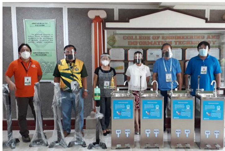
CvSU officials and employees during the unveiling

for draining the used water and soap. Both models will initially be deployed in various offices around Cavite State University – Main Campus.