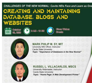
Cropped Poster of the event

Other topics discussed in the said webinar series are: Managing Stress, Data Privacy Law, Use of Other Technologies; and Plagiarism and Copyright Laws.