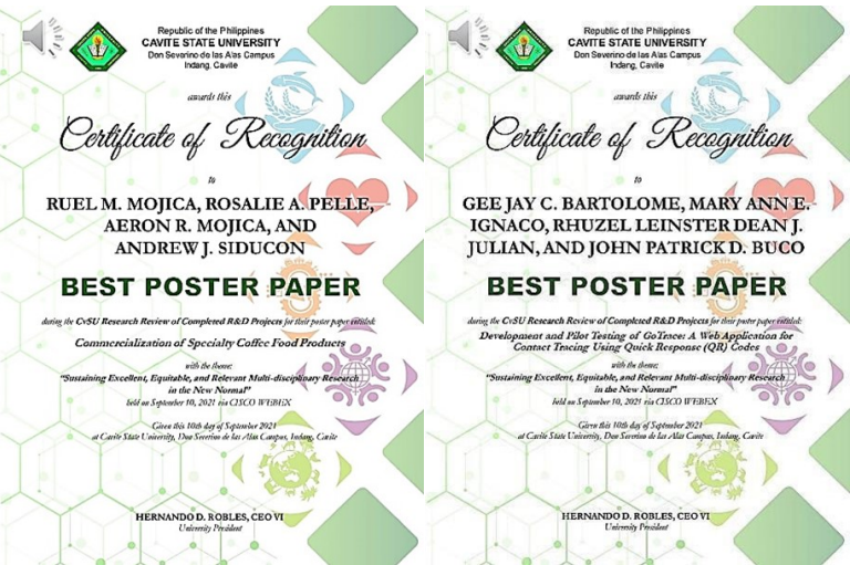
The Certificates of Recognition received by the presenters during the Annual In-House Review for the Best Poster category