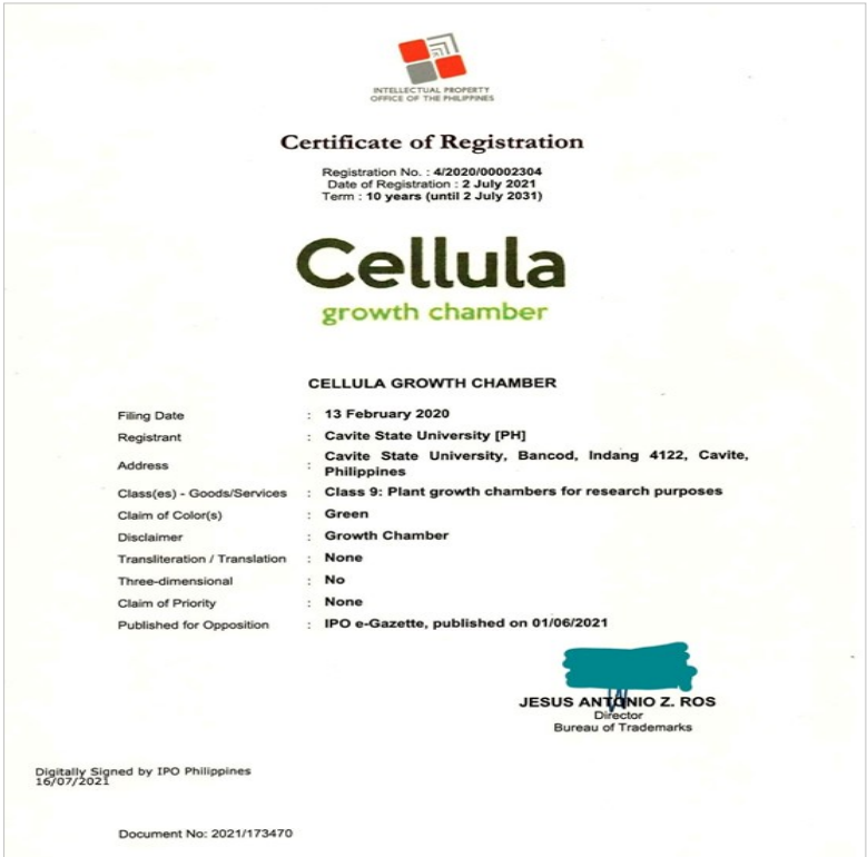
The trade name’s certificate of registration for Cellula Growth Chamber