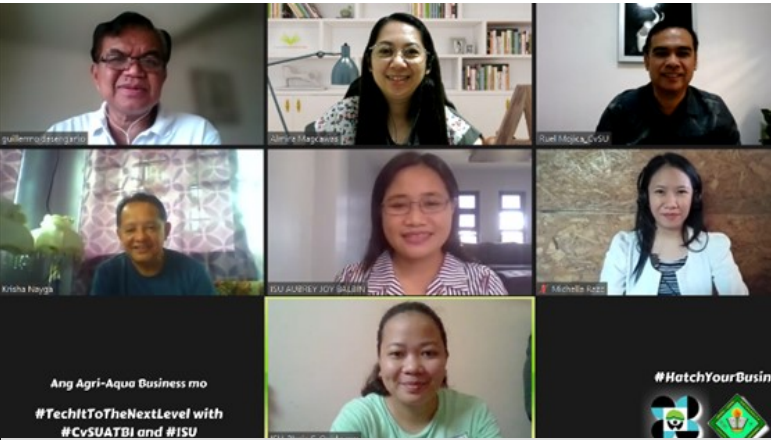
CvSU and ISU ATBI project teams during the meeting