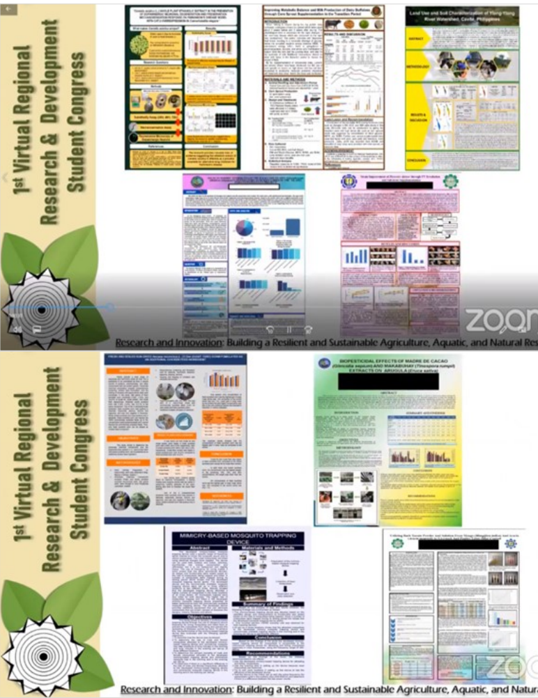
Poster entries in the 1st Virtual Student Congress