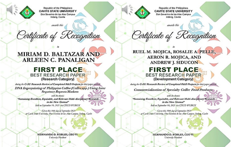
The Certificates of Recognition received by the presenters during the Annual In-House Review for the Best Paper category