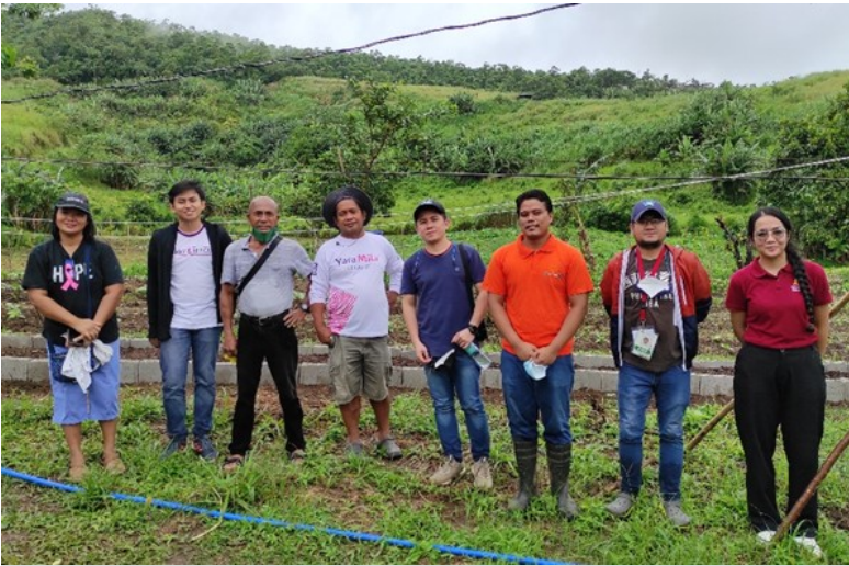
The assessment team together with the manager of Casa Bella Farm

A follow-up farm visit and consultation meeting regarding the crafting of a farm development plan was held last September 1. It was initiated by Mr. Fortunato De la Peña, DOST Secretary,