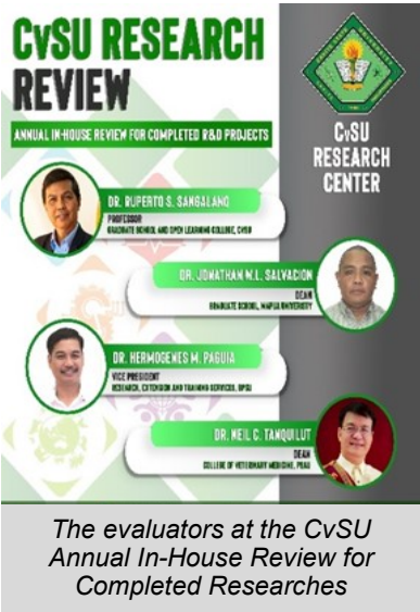
Poster of the 2nd day of the CvSU Annual In-House Review

The event also showcased the presentation of 14 externally-funded and 30