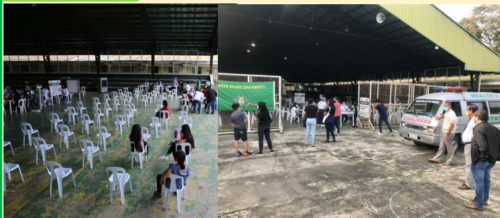
With the assistance of the College of Nursing, around 300 individuals were vaccinated during the National Vaccination Drive held on 01 December 2021 at the CvSU Quadrangle.