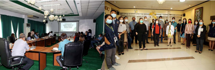
CvSU and DOH officials during the collaborative meeting on the establishment of College of Medicine.