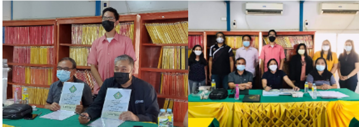
MOU signing between CvSU – Trece Martires City Campus and LEENTech Network Solutions (left photo) and City College of Tagaytay on 02 February.