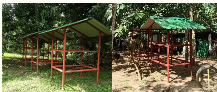
Fabrication of movable bee houses for AgriEco-Ecotourism Park