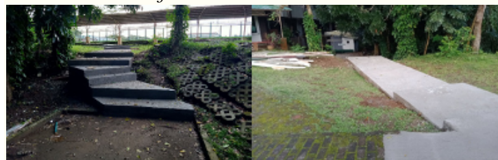
Construction of pathwalk at the back of Administration Building