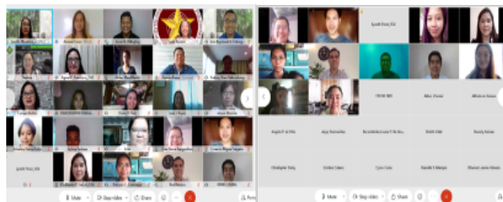
College of Education opens 2021 with student research colloquium via Cisco Webex on 08 January