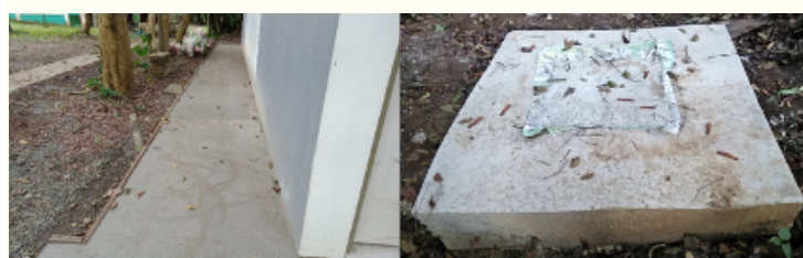
Construction of pathwalk and installation of purifying tank in the comfort room near the new Graduate School Building