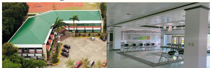
Repair and repainting of the roofing of and exterior of the Administration Building