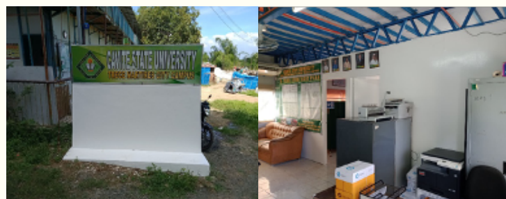
Construction of university marker and installation of double wall partition in CuSU-Trece Martires City Campus