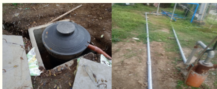
Installation of purifying tank in the communal comfort room near the College of Education