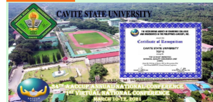
The Accrediting Agency of Chartered Colleges and Universities in the Philippines (AACUP) Inc. recognized Cavite State University for being Top 6 among the 10 Most Improved Internal Quality Assurance Unit for 2019. The awarding was held during the 34th AACUP Annual National Conference held online on 11 March.