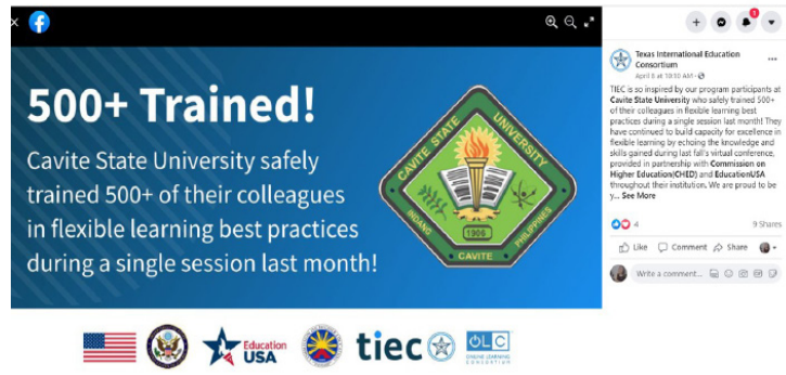
Facebook post by TIEC acknowledging CvSU's effort in building the capacity of its faculty members

QS is the leading global career and education network, helping individuals and companies fulfill their potential through fostering international mobility, educational achievement and career development.