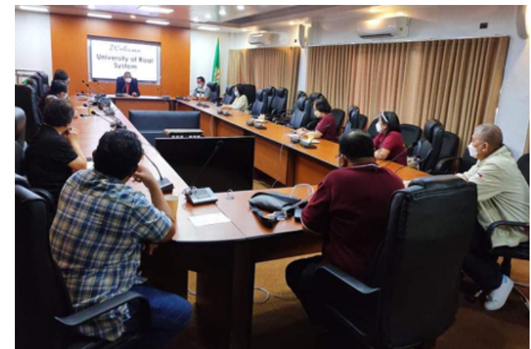
Visitors from the University of Rizal System

After the open forum with CvSU's Executive Council, the visitors went to see the Infirmary, College of Nursing, and the Agri-Eco Tourism Park.