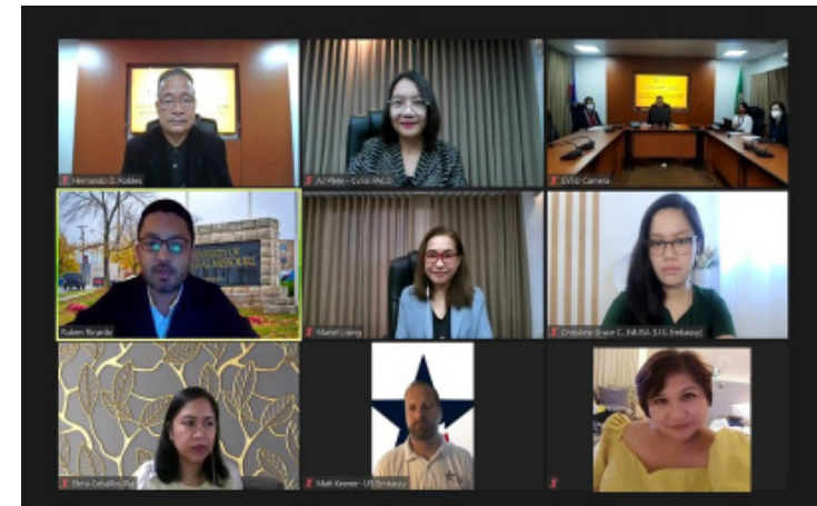
Officials from CvSU, University of Central Missouri, CHED, and EdUSA during the virtual MOU signing

The University of Central Missouri located in Warrensburg, Missouri is known for its flexible environment, convenient schedule, and online courses and programs that provide high-quality instruction in a supportive community of learning. It has also