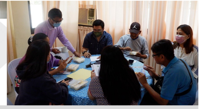
Participants of the training workshop and stakeholders' consultation meeting during the conduct of SWOT analysis

Aside from the series of discussions, SWOT analysis was also included in the activity. The results of the training workshop will serve as basis in the development of the mission and vision of the SPRINT Center and preparation of its manual of operations. For. Magpantay delivered the closing remarks after the distribution of the certificates of participation. ( Jhon Laurence B. Herrera ).