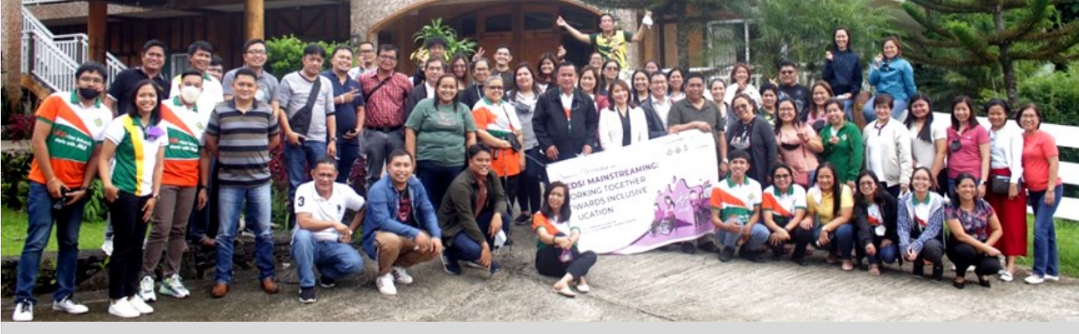
The participants during the Seminar-Workshop on GEDSI Mainstreaming at Lucban, Quezon