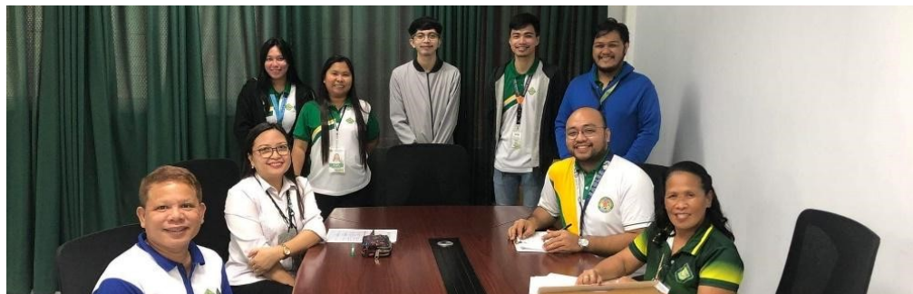
The KMC personnel and the 5S auditors of CvSU