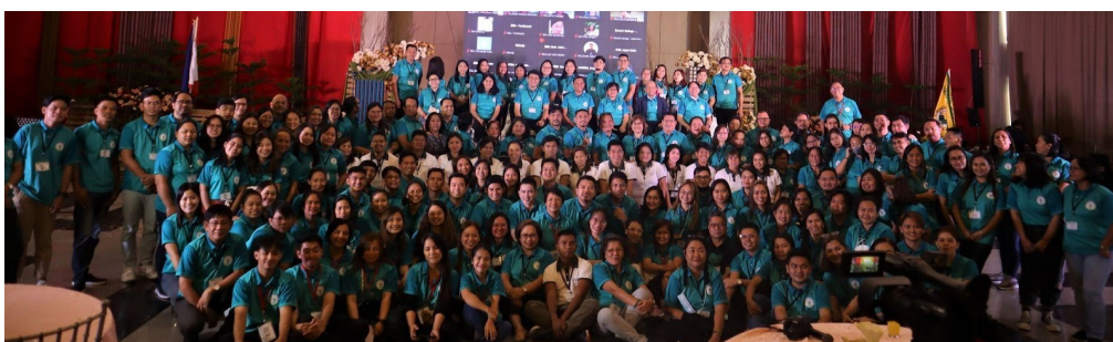
DOST-PCAARRD Technology Transfer and Promotion Division members, the ATBI project members, incubatees, and agency partners of the 22 State Universities and Colleges with ATBI

This event was organized by Benguet State University (BSU)-Agribased Technology Business Incubator/Innovation Center (ATBI/IC) and Philippine Council for Agriculture, Aquatic, and Natural Resources Research and Development (PCAARRD) Technology Transfer and Promotion Division (TTPD). It was designed to enhance the ecosystem for Agri-Aqua Technology Business Incubation (ATBI) and offered a venue for ATBI stakeholders to exchange best practices. Additionally, it was held to increase the connection between the 22 ATBIs throughout the nation, showcase the innovations and products of the incubatees, and foster cooperation and