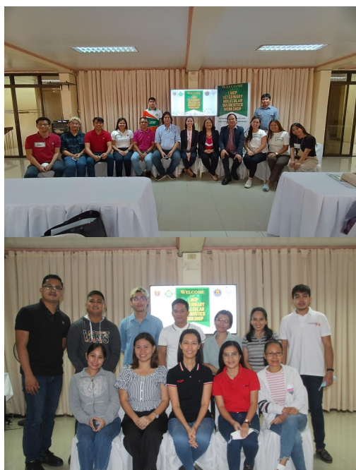
Participants from the Luzon farms (right) and from the Visayas and Mindanao farms (left) together with the members of the LMDP team

The project has been duly supported by the Newton Fund, UK Research and Innovation, and the Department of Agriculture–Biotechnology Program Office.