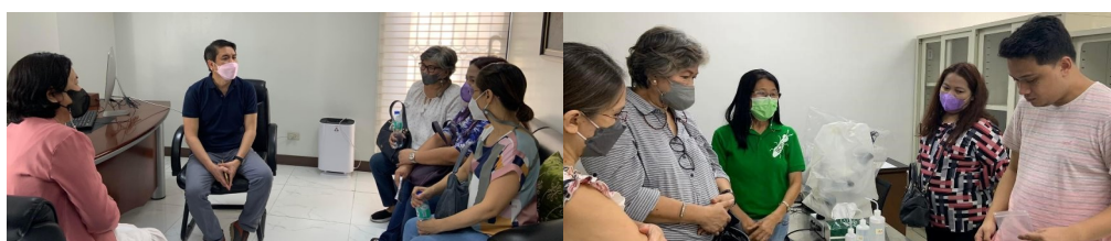
The STAARRDEC Secretariat during the conduct of field visit and evaluation at DLSU-Laguna Campus (left) and DLSU-Dasmariñas City Campus (right)

approved during the 93rd RRDCC meeting held on November 16, 2022 at the Department of Agriculture-Agricultural Training Institute Regional Training Center (DA-ATI RTC) IV-A, Trece Martires City, Cavite.