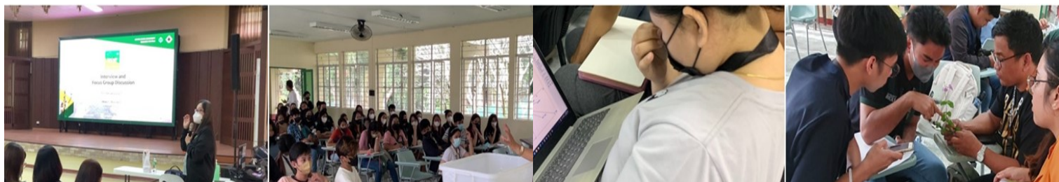
Field Conduct of Interviews and Focus Group Discussion (left) and Ecological Modelling (left) and Herbarium Preparation and Collection and Physicochemical Analyses of Water Samples (right)