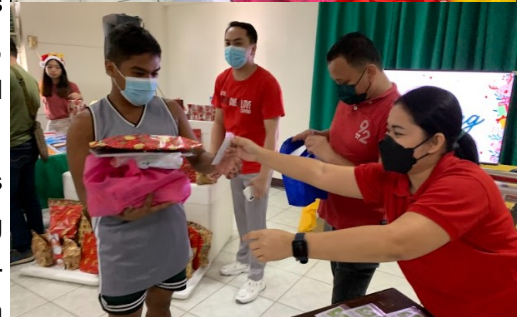
Distribution of food and gift packs