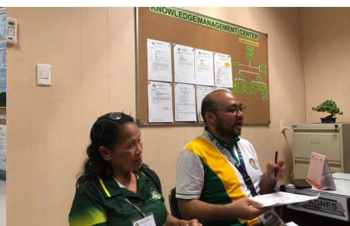
5S auditors' feedback after checking the compliance to the quality workplace standards