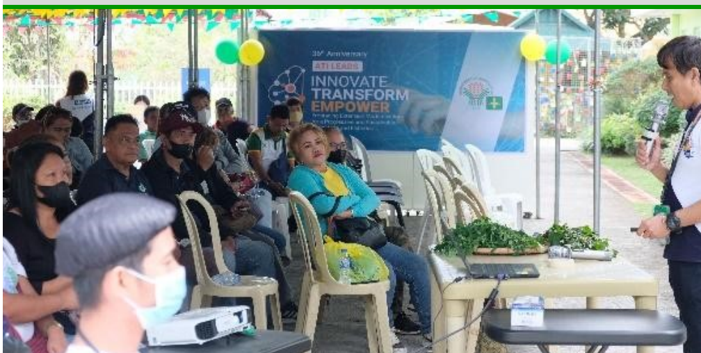
ES staff joined the ATI's seminar on making organic fertilizer