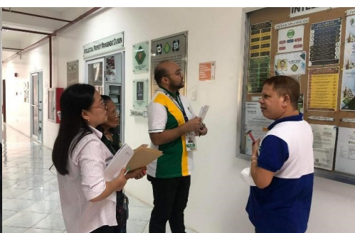
5S audit on KMC (left) and ITSO (right)