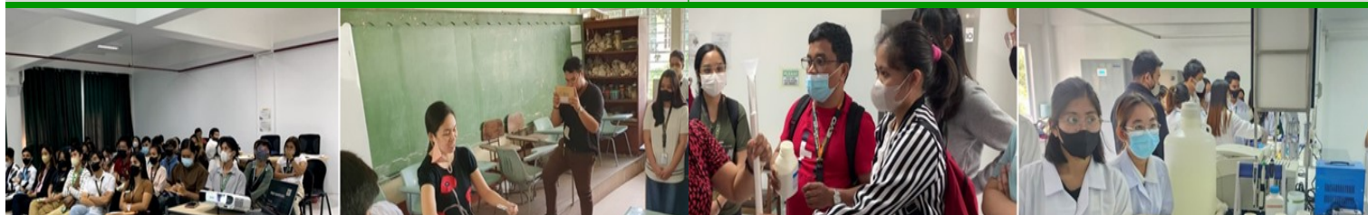
Field Sampling (left) and Microbiological Techniques (right)