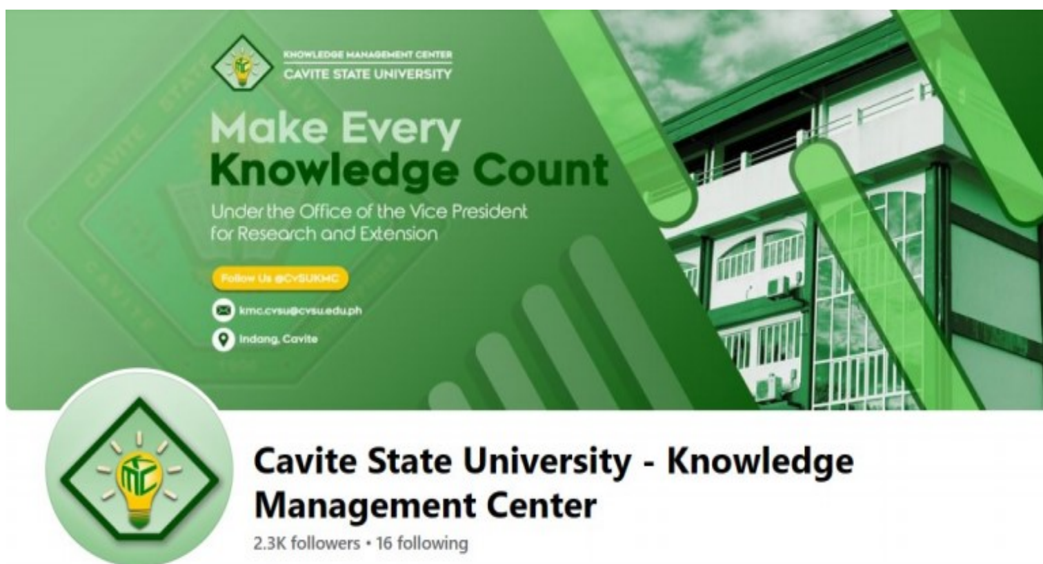
The CvSU Knowledge Management Center FB page