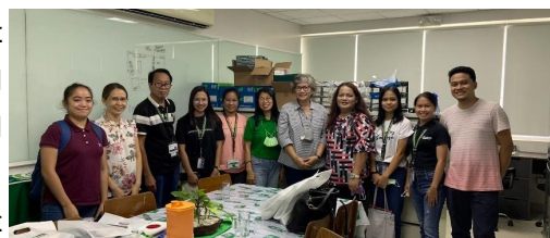
The STAARRDEC Secretariat together with the Biological Control Research Unit team

With the approval of the Regional Research and Development Coordinating Council (RRDCC), the De La Salle University – Dasmariñas (DLSU-Dasmariñas) and the De La Salle University – Laguna (DLSU-Laguna) and evaluation, the campuses became the newest members of the Southern Tagalog, Aquatic and Resources Development and Extension Consortium (STAARRDEC). DLSU-Laguna and the consortium was presented and