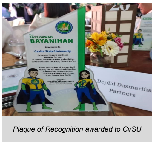
Plaque of Recognition awarded to CvSU