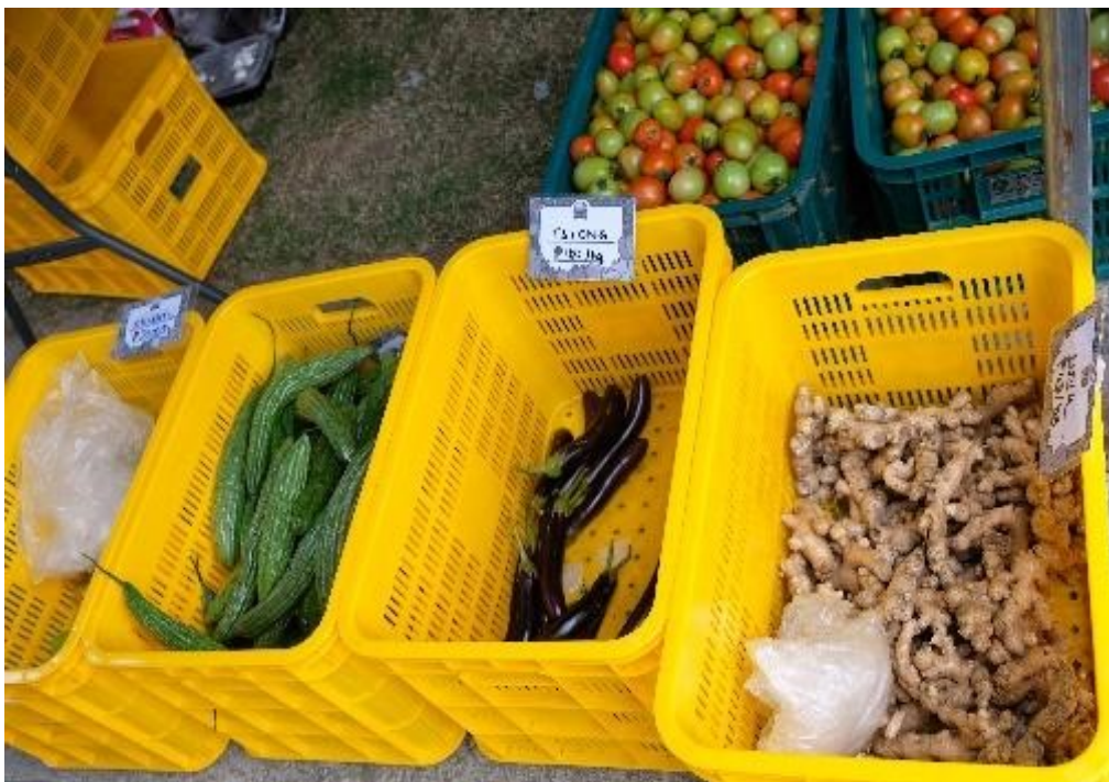
Products and exhibitors during KADIWA retail selling