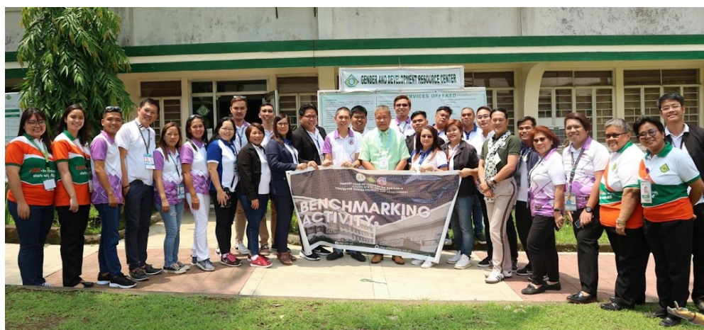
Photo opportunity of the PLSP delegates and GADRC staff

State University GAD Implementer in Calabarzon for four consecutive years by the Regional Development Council (RDC) of Calabarzon. In addition, he said that the Agri-Eco Tourism Park is the only SUC-based park that has been approved by the Department of Tourism (DOT), thus he lastly (continue on page 5)