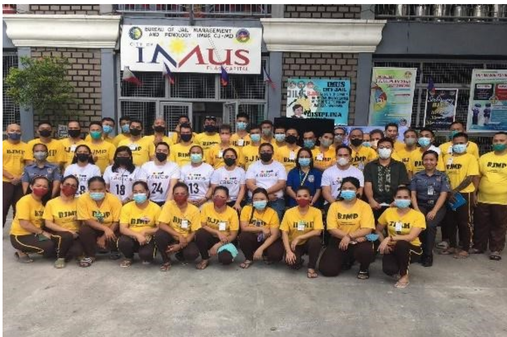
Photo opportunity during the visit of CvSU-Imus Campus to BJMP-Imus

As part of the activity, the campus visited the Bureau of Jail Management and Penology (BJMP)- Imus City last May 30 to enlighten them about the different projects of every department under the said program. The extension projects of the campus have been continuously conducted with the aim of extending assistance to its selected clientele. These include Aiming Literacy and Public Awareness Towards Opportunities (ALIPATO) of the Department of Languages and Mass Communication;