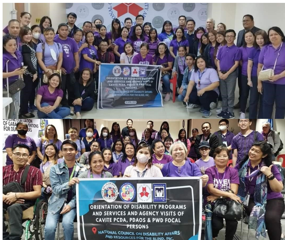
Delegates of the Lakbay-Aral Program