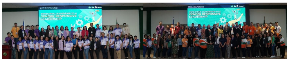
Participants during the two-day seminar-workshop