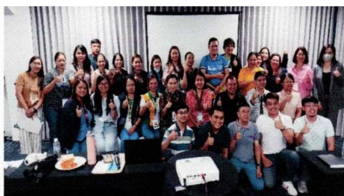
Participants during the Youth Development Session (YDS)