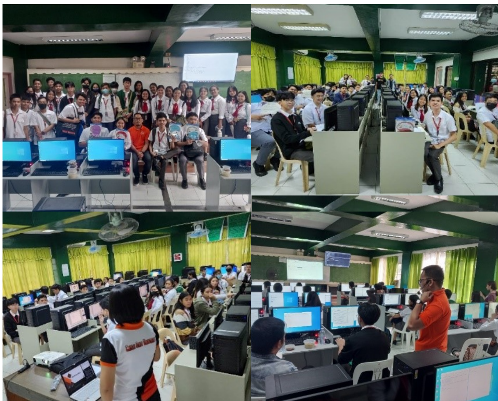
Participants during the training