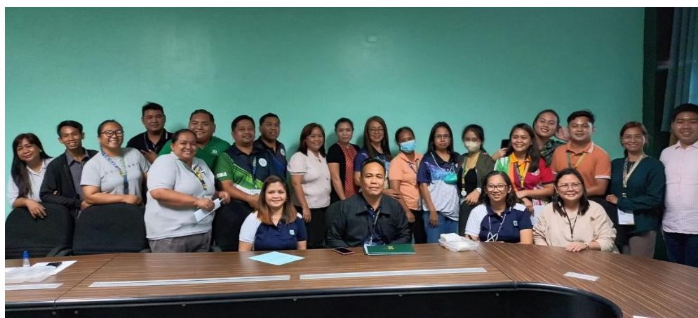
Photo opportunity during the last part of the seminar workshop