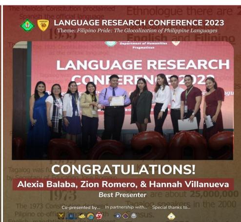
BAELS students while receiving their Certificates of Recognition