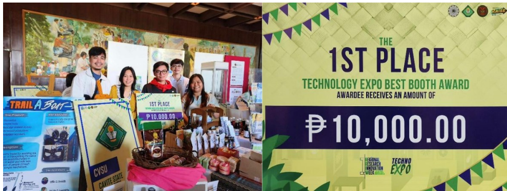
The KMC personnel represented CvSU and won the 1st Place for the Technology Expo Best Booth Award during the 1st RRIW 2023

Cavite State University (CvSU) bagged 1st place for the Best Booth Award at the Technology Expo during the 1st Regional Research and Innovation Week (RRIW) held at Dioscoro L. Umali Hall, University of the Philippines - Los Baños (UPLB) on September 23 - 26, 2023. With the theme, "Catalyzing Regional Advancement through Research and Innovation", this event, organized by (continue on page 2)