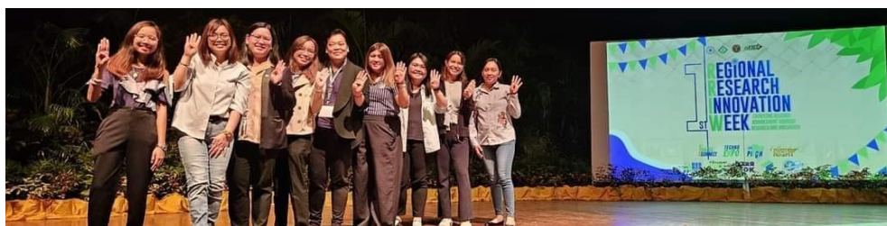
The BANYUHAY team during the 1st RRIW 2023