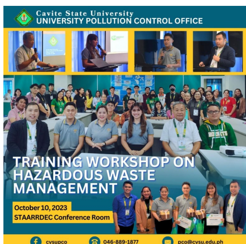
Photos during the Training Workshop on Hazardous Waste Management

The University Pollution Control Office (UPCO) conducted a Training Workshop on Hazardous Waste Management for its Pollution Control