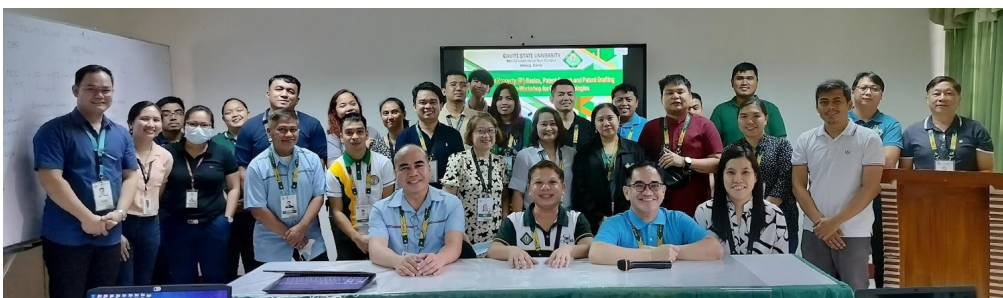
Participants during the IP Basics seminar-workshop

The seminar-workshop aimed to equip faculty members of the college with the knowledge and skills necessary to protect their intellectual properties and boost the research and innovation capacity of the college. It was attended by 27 faculty members from various