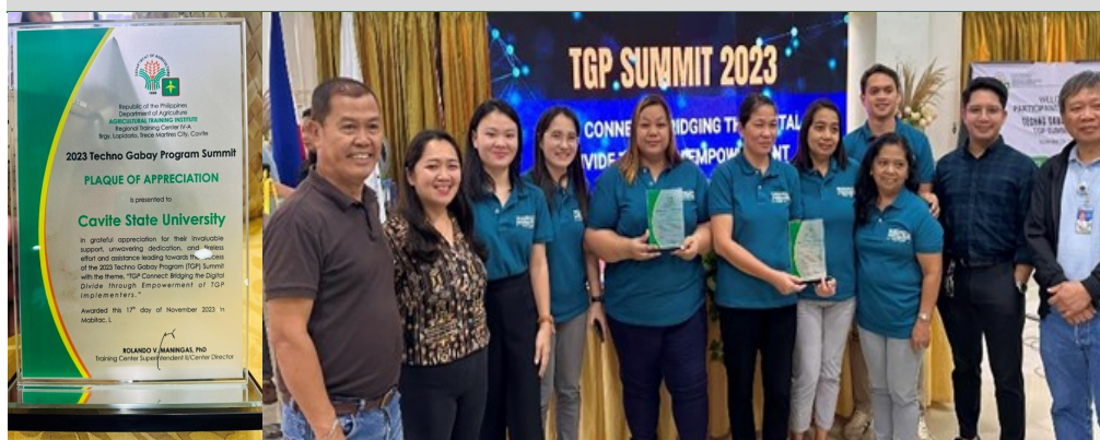
Day 3: Team CvSU received a plaque of appreciation together with FIT OPA Cavite