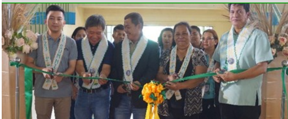
Day2: Ribbon cutting ceremony and viewing of accomplishment report exhibit