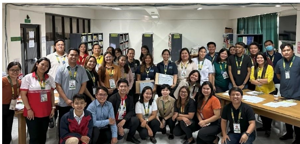
The participants with the trainers of the Sign and Shine workshop