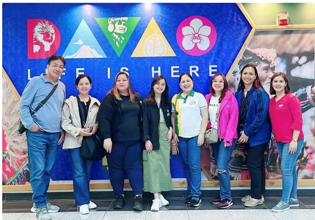
SciCAT team at Davao International Airport