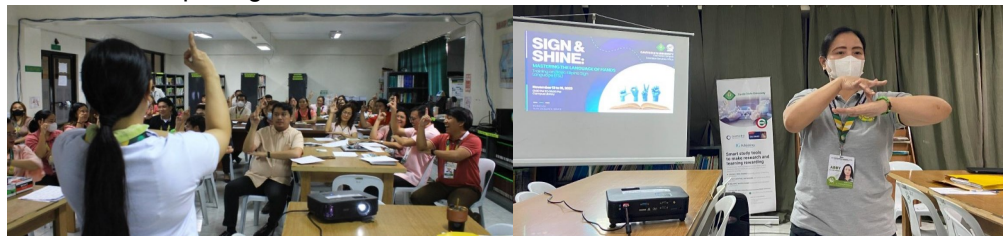
The trainer while demonstrating various signs

This symbolic gesture represented unity and a collective commitment to diversity within the CvSU-Carmona community. The workshop stands as a testament to the campus’ dedication to fostering inclusivity and creating a community where everyone’s voice, expressed through the language of hands, is heard and valued.