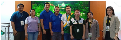
The SPRINT Center and DOST-FPRDI personnel during the meeting