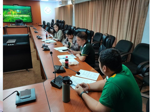
Photos of SPRINT Center and DOST-FPRDI personnel during the meeting