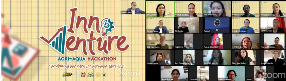
Screen captures of the first session of InnoVenture: Agri-Aqua Hackathon

The Regional Agri-Aqua Innovation System Enhancement (RAISE) Program in Region IV–Agri Aqua Technology Business Incubator (ATBI) launched the Innoventure: Agri Aqua Hackathon (IVA AH) on January 26, 2024. This was held to help their incubatees with the development of advancements in their business ventures, may it be from the technological aspects or in the business aspects. This was particularly conducted to equip the participants with the necessary knowledge and skills to create a business model canvas, develop brand and promotional materials for the incubates business, and enhance their confidence and presentation skills for pitching to potential investors through a series of trainings, webinars and mentorships. A series of training and activities was scheduled until February 16, 2024 via Zoom and Facebook Live. Face-to-face mentoring and workshops