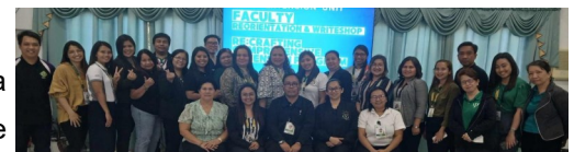
The faculty and staff of CvSU-Silang Campus together with the director and unit heads of the Extension Services

On the first day of the activity, a workshop was conducted to determine the possible beneficiaries in connection with