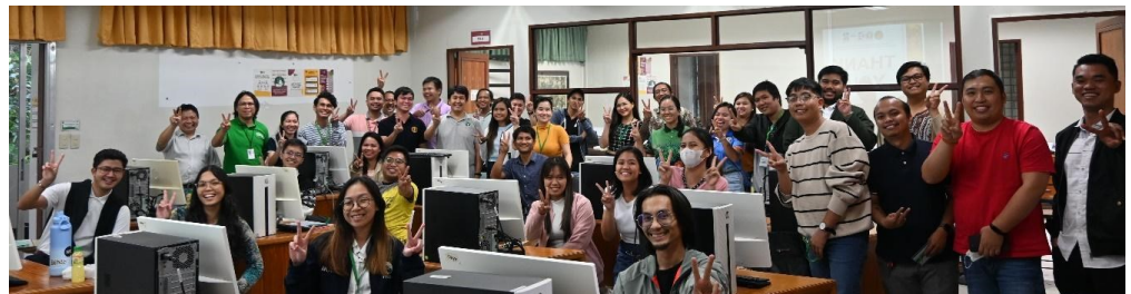
Participants of the GIS and Remote Sensing training

RAISE IV – Regional ATBI ... (from page 1) different trainings and mentorships on developing their business, financial and strategic plans, logos, brand, brochure, trademarks, and social media marketing tactics.