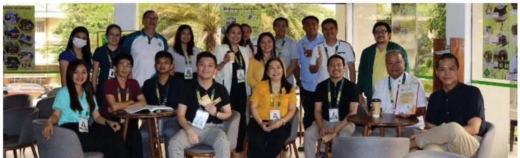
The participants and the organizers of the CvSU BRITE Center's exhibit held at Café Severino