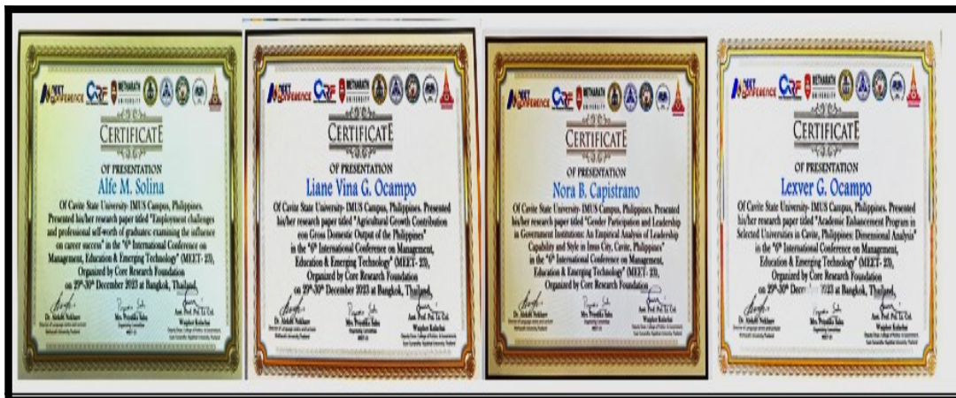
Certificates received by the representatives of CvSU - Imus

The upcoming 7th MEET 2024 International Conference will be held in Cebu City, Philippines. CvSU - Imus Campus together with Polytechnic University of the Philippines and other higher education partner institutions are set to co-host the said conference.