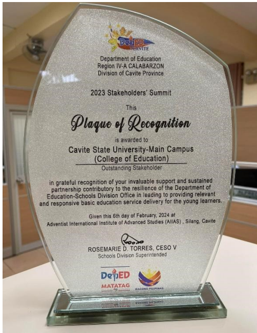
The Plaque of Recognition