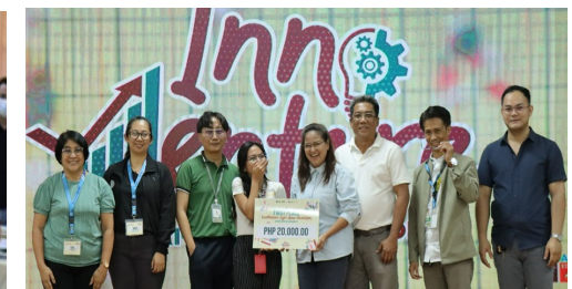
Photo of the IVAAH overall winner, HeBrews Highland Coffee Trading at the awarding ceremonies