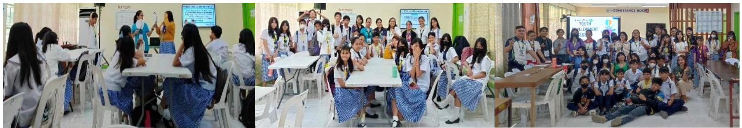
The 4Ps beneficiaries and students of GEANHS during the session

Cavite State University - Imus Campus, in partnership with the Department of Social Welfare and Development-Imus, initiated the first module (Module 1) of the Youth Development Session (YDS) Program on January 10, 2024 at General Emilio Aguinaldo National High School (GEANHS).