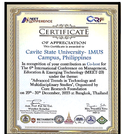
Certificate awarded to CvSU - Imus