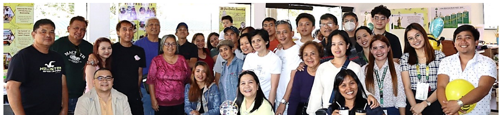
Special episode with the beekeepers and attendees

"Feb-e-BEEg: Extending Love for Bees and the Community" exhibit continues to captivate audiences with its bee-related discussions, fostering an environment of learning and collaboration. As the series extends to March 2024, anticipation builds for yet another bee-related episode that may inspire faculty members, students, beekeepers, and interested individuals.