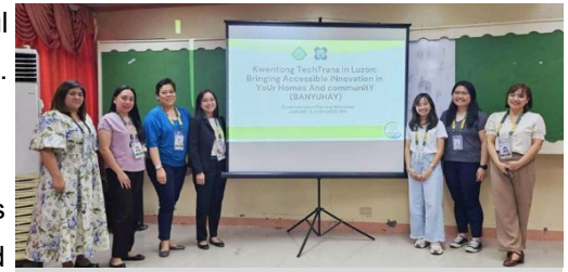
BANYUHAY's Project Team Members

The workshop successfully revitalized the communication plan by fusing it with renewed clarity, precision, and strategic depth.