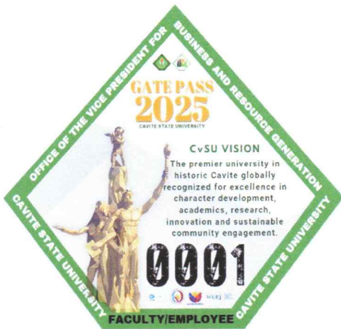
FACULTY/ EMPLOYEE – 3.5 x 3.5 inches