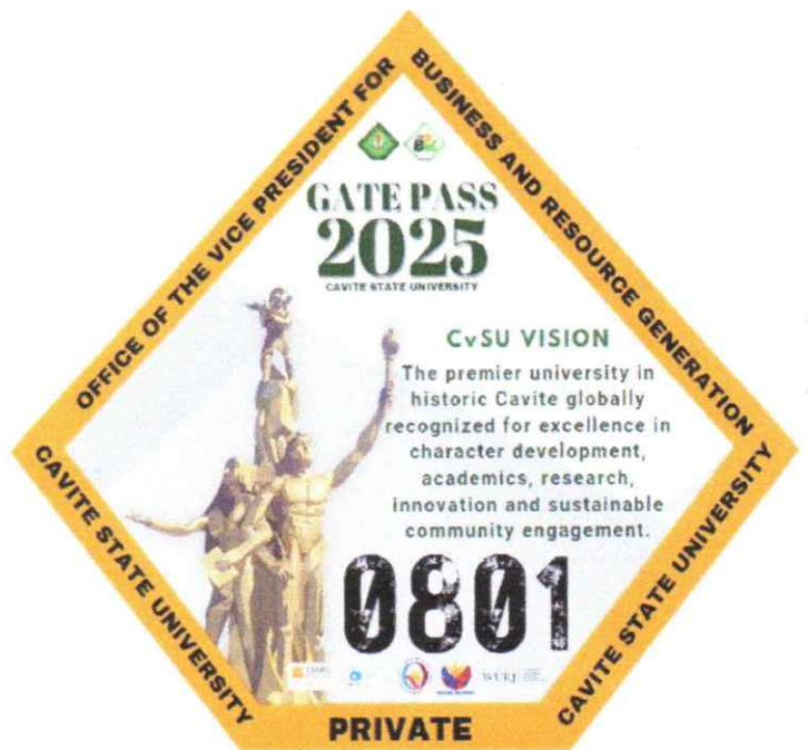
PRIVATE – 3.5 x 3.5 inches