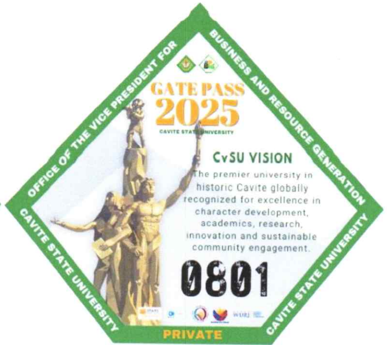
PRIVATE # 0801 - 2000