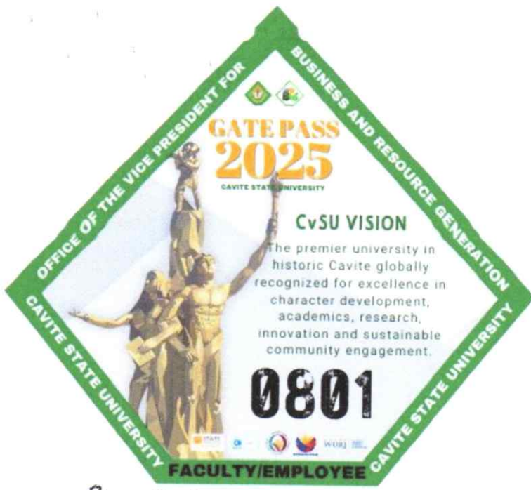
3 x 3 inches Faculty/Employee - # 0001 - 0800