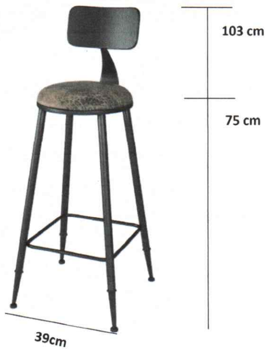
Item No. 3. Bar Stool (39cm X 103cm X 75cm)