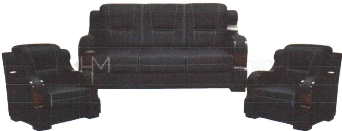
Sofa Set: Foam- Standard or Uratex