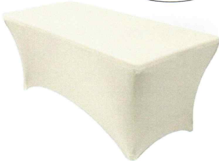
Folding Table with Spandex Cover