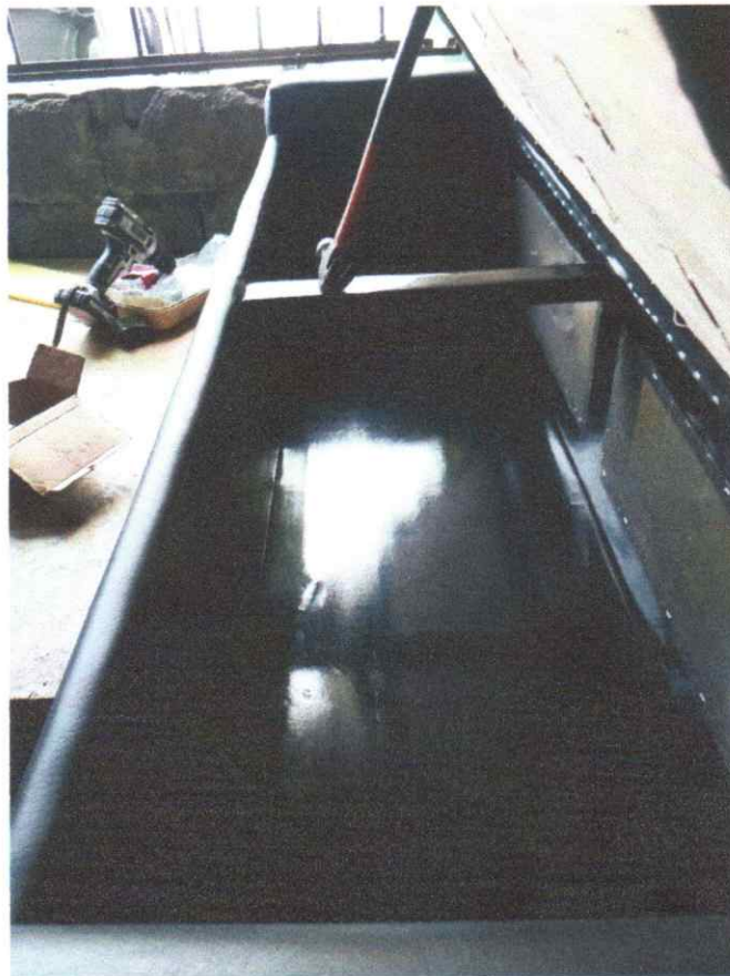
Inside covered with laminate or linoleum material to avoid wetting of wood materials.