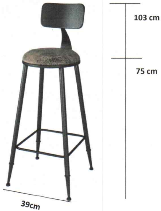
Item No. 3. Bar Stool (39cm X 103cm X 75cm)