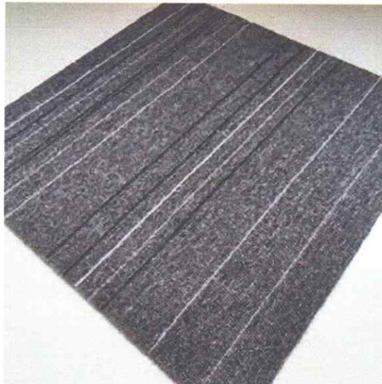
PP Material 50X50 Washable Rugs Commercial Carpet Tiles Used for Office /Loop Pile Office Commercial Decorative Removable Carpet Tiles/Floor Carpet light brown