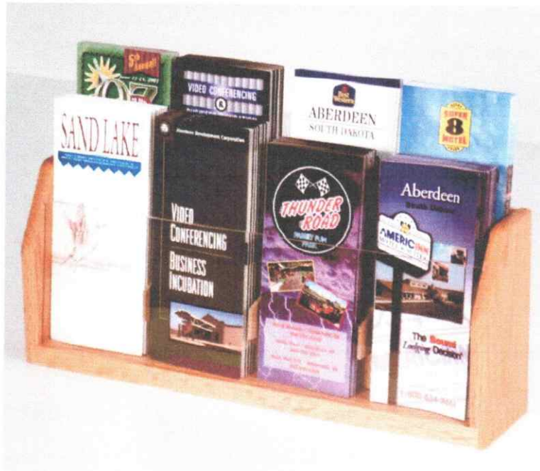
Wooden Mallet 8-Pocket Countertop Brochure Display, Light Oak