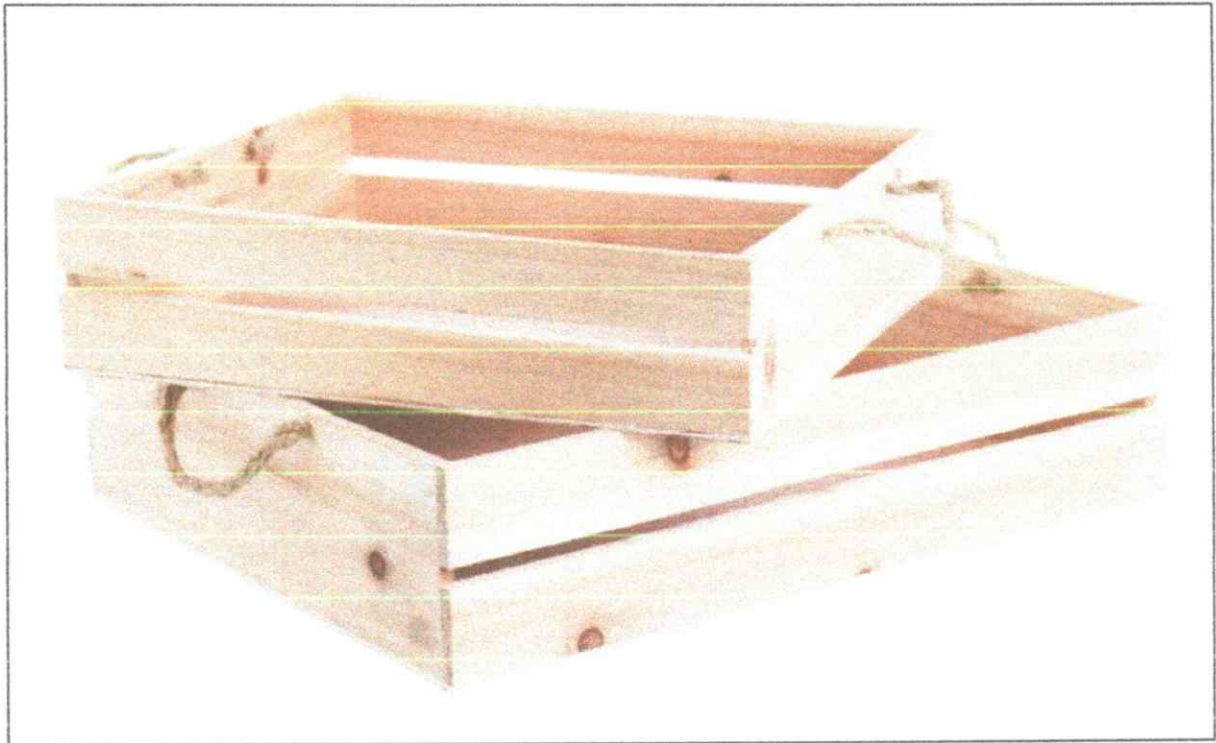
Wooden Crate with Rope Handle Set of 2 Natural (43x34x10cmH) Gourmet Hamper Crate SET