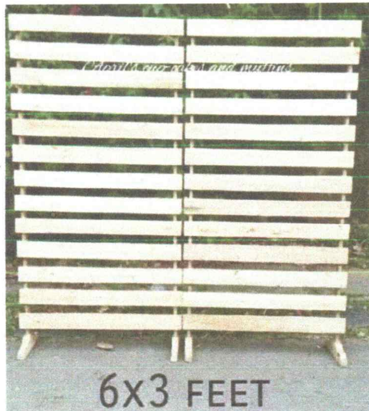
Wooden Backdrop 6x3 feet, foldable for easier transport