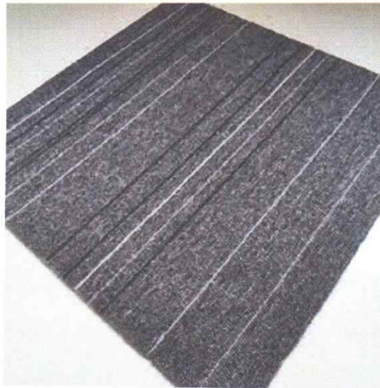
PP Material 50X50 Washable Rugs Commercial Carpet Tiles Used for Office /Loop Pile Office Commercial Decorative Removable Carpet Tiles/Floor Carpet light brown